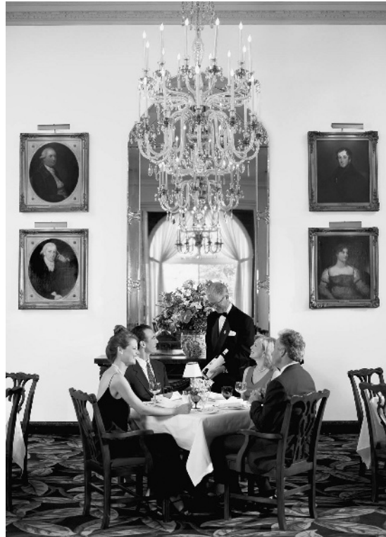
✕ Fine dining is just one attraction of many traditional resorts.

Facilities in the 25- to 125-room range can include properties from the above group as well as small specialty resorts. Many are called lodges and cater to hikers, hunters, and skiers. Part of this category is the growing number of boutique resort hotels that cater to a small, upscale segment of the market. These are often located in beautiful and delicate settings that are not appropriate for larger-scale development.