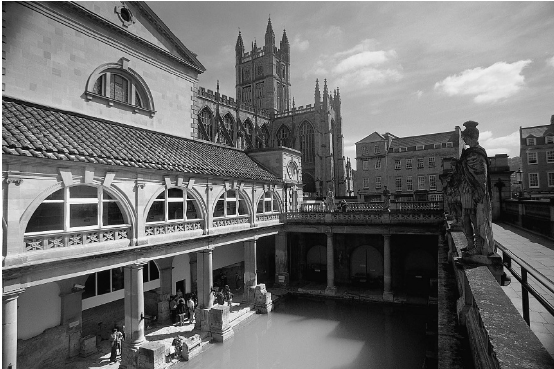
✕ A Roman bath in Bath, England.

Back in England, King Charles II restored the monarchy in 1660 after years of Puritan rule. He spent time at the popular resorts of the day—Bath, Tunbridge Wells, and Harrogate. Thus began a long history of attractions being popularized by the rich and famous, a tradition that continues today. In other parts of the world, royalty continues to be the trendsetters, while in North America, stars of the popular culture determine the “in” places. There is an old saying in tourism that mass follows class. Destinations are initially made popular by a small band of influential people. This puts the place on the map. Seeking to emulate this group, others are attracted to the location.