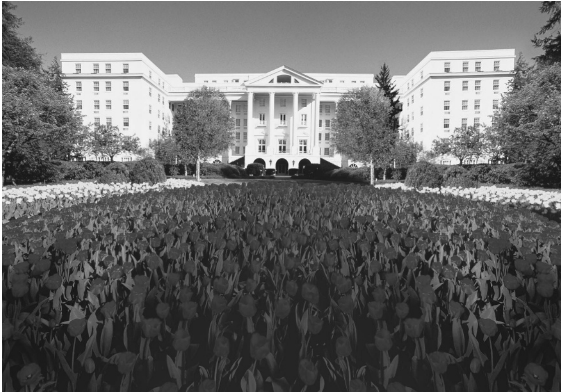
✕ The Greenbrier in White Sulphur Springs, West Virginia, is a traditional resort.

Resort Cities America's first resort city was Atlantic City. Developed in the late 1800s, it attracted the middle as well as the upper classes. It built the first boardwalk to accommodate those seeking the health benefits of sunshine and fresh air, the first amusement pier that extended over the Atlantic, and the Observation Roundabout—later