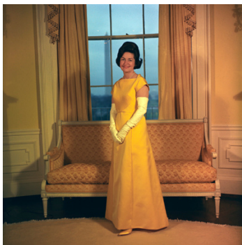
Lady Bird Johnson

working as a reporter at the Daily Texan when she met Lyndon B. Johnson (1908 -1973). After their marriage on November 17, 1934, they moved to Washington, DC where Lady Bird's political education began.