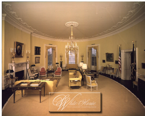
Yellow Oval Room in the White House

When Millard Fillmore became the thirteenth president of the United States, he found no books in the Executive Mansion. Knowing that Abigail would also be dismayed when she arrived, he asked Congress for an appropriation to purchase books and the furnishings to form a library. After much deliberation, $2,250 was appropriated by Congress for the first White House Library. Abigail chose the oval parlor on the second floor of the Executive Mansion to become the library in what is today known as the Yellow Oval Room.