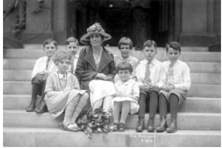
Grace Coolidge with Clarke School children