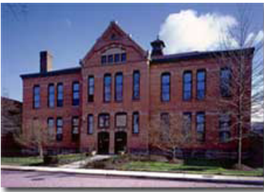
Brownell Street Public School

While James Garfield pursued additional education at Williams College in Williamstown, Massachusetts, Lucretia accepted a teaching position in Ravenna, Ohio where she taught French, arithmetic, algebra, and reading. She later moved to a position at the Brownell Street Public School in Cleveland, Ohio. She took advantage of the "big city" by attending plays and taking music, drawing and painting classes. With her upcoming marriage in the fall of 1858, Lucretia's teaching career came to an end as she returned to Hiram to prepare for her wedding.