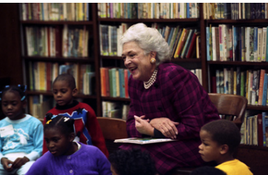
Barbara Bush reads to children

Barbara Pierce Bush grew up in Rye, New York as an avid reader. She met George Bush (1924 - ) at a Christmas dance in 1941, and they became engaged in 1943 just before George entered the navy. Barbara entered Smith College in Northampton, Massachusetts, but her heart and mind were preoccupied with her fiancé in combat. Though she left school to plan for a December 19 th wedding,