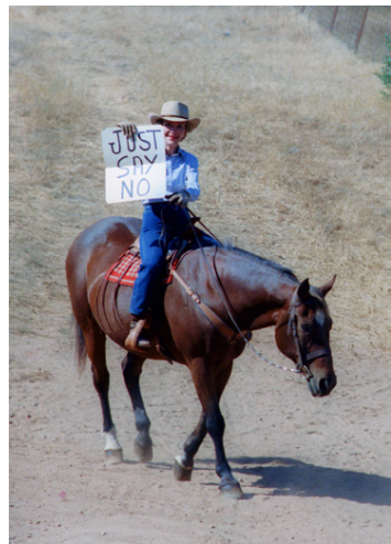
Nancy Reagan on horseback holding “Just Say No” sign

Nancy Reagan committed herself to her drug awareness cause, reading and writing thousands of letters to children who wrote to her of their drug problems. She co-hosted a special episode focusing on the national drug problem on Good Morning America and narrated a PBS documentary, “The Chemical People.” By 1985 there were over 5,000 “Just Say No” after school clubs founded in the United States and abroad. She also founded the Nancy Reagan Drug Abuse Fund and worked with such groups as the Girl Scouts (a “Drug Free” merit badge was created) and Kiwanis Clubs, which launched a promotion of