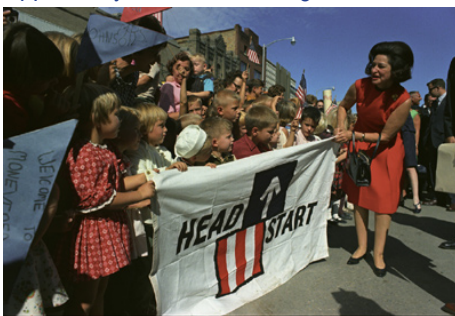
Lady Bird holding Head Start banner

Shriver from the Office of Economic Opportunity met with her to give her details on a new program called Operation Head Start, she was intrigued. She agreed to meet with the Advisory Council on the War on Poverty about the proposal, and Shriver asked her to sponsor Project Head Start as honorary Chairman. She agreed with one stipulation: she