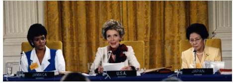
Nancy Reagan with first ladies from Jamaica and Japan

After a second presidential election victory in 1985, Mrs. Reagan took her drug prevention campaign to the international level, inviting first ladies from countries around the world to attend a conference on drug abuse in Washington, DC and Atlanta, Georgia. A crowning moment came when the Anti-Drug Abuse Act of 1986 was signed into law on October 27 by President Ronald Reagan (1911-2004).