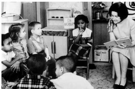
Lady Bird reads to children

didn't want to be just honorary Chairman – “If I take it on, I want to work at it.” 2 National studies showed that many children from inner cities and poor rural areas lacked basic social skills. The initial program was for 100,000 children who would be entering the first grade that year. The course lasted only eight weeks, but during that time the child received a free meal each day and a