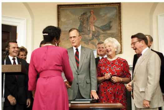
National Literacy Act of 1991 is signed

Illiteracy and the social and economical problems it can cause children and adults became the cause that Mrs. Bush embraced. As First Lady she hosted a Sunday evening radio program in 1990 called, "Mrs. Bush's Story Time." She read children's book selections with the help of such favorites as Mickey Mouse, Big Bird and Bugs Bunny. She watched proudly as President Bush signed the National Literacy Act of 1991. She authored two children's books, both penned from the viewpoint of her beloved dogs, C. Fred's Story in 1983 and Millie's Book in 1989. All royalties from these books support literacy causes.