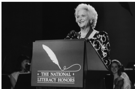
Barbara Bush, The National Literacy Honors

Barbara Bush launched The Barbara Bush Foundation for Family Literacy on March 6, 1989. She serves as Honorary Chairman and President of the foundation. The mission of the foundation is to create literacy as a value in every American family and to support the development of family literacy programs by awarding grants, and encouraging parents to read to their children. The foundation has launched several statewide programs: The Maine Family Literacy Initiative, The First Lady's Family Literacy Initiative for Texas, and The Governor's Family Literacy Initiative for Florida. "A Celebration of Reading" is the foundation's largest fundraiser.