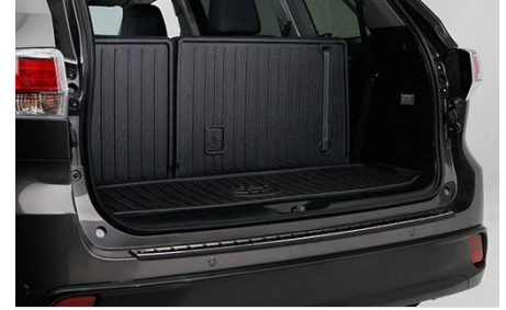
Cargo Liner $142.50

The Towing Hitch Ball is designed and tested to meet Highlander and Highlander Hybrid's towing specifications and quality standards. It works seamlessly with the accessory Towing Hitch.