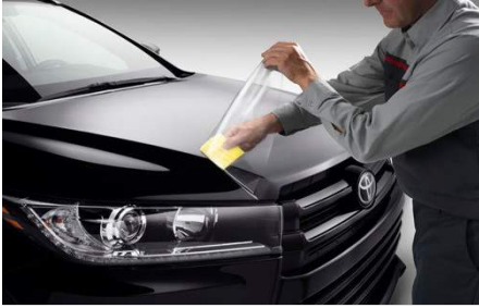
Pro Series Paint Protection Film $450.00

Guard your Highlander from weathering, UV radiation and road debris that can chip and scratch the finish with 3M Pro Series Genuine Toyota Paint Protection Film. This durable and nearly invisible thermoplastic urethane is designed to protect the hood and front fenders to maintain a like-new appearance