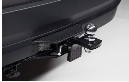
Towing Hitch Ball - 1 7/8" $52.49

Guard your Highlander from weathering, UV radiation and road debris that can chip and scratch the finish with 3M Pro Series Genuine Toyota Paint Protection Film. This durable and nearly invisible thermoplastic urethane is designed to protect the hood and front fenders to maintain a like-new appearance