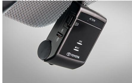
Toyota Genuine Dash Camera $625.00

Optional 5.0m Home Power Cable. This cable can be purchased instead of or in addition to the standard 2.5m Home Power Cable (PK5A4-89J40)