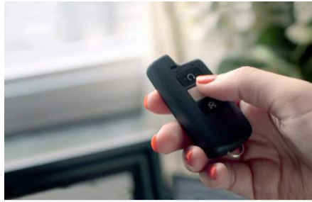
START+ Long Range Remote Engine Starter $949.95

The Towing Hitch system is specifically designed and manufactured for Highlander and Highlander Hybrid models, and has been engineered to obtain the vehicle's safest maximum tow rating. The included Towing Hitch Wire Harness with 4 pin flat connector seamlessly integrates with Highlander and Highlander Hybrid's electrical system. All Toyota Genuine Hitch systems are e-coated and powder coated to prevent rust and corrosion and they are designed to meet or exceed all industry towing standards.