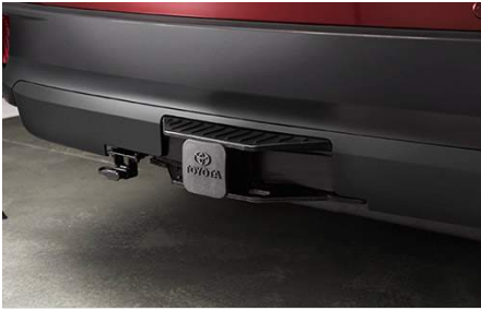
Towing Hitch with Wire Harness $1,009.00

The Towing Hitch system is specifically designed and manufactured for Highlander and Highlander Hybrid models, and has been engineered to obtain the vehicle's safest maximum tow rating. The included Towing Hitch Wire Harness with 4 pin flat connector seamlessly integrates with Highlander and Highlander Hybrid's electrical system. All Toyota Genuine Hitch systems are e-coated and powder coated to prevent rust and corrosion and they are designed to meet or exceed all industry towing standards.