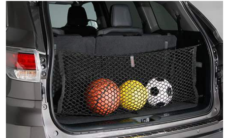
Cargo Net $74.50

The Toyota Genuine Dash Camera is designed to provide a safe and memorable driving experience in your Toyota vehicle. Safely record the on-goings of the open road while keeping your eyes on the road. Never miss a moment in motion; capture it! The Toyota Genuine Dash Camera will also allow you to record the surroundings of your vehicle while it is parked