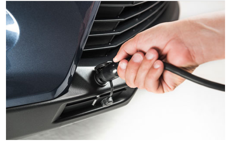
Premium Plug-In Block Heater $457.50

Body Side Mouldings protect Highlander or Highlander Hybrid from dings and bumps, while adding a touch of elegance to the vehicle's exterior. Constructed from highly durable material that has undergone Toyota's rigorous product testing, the Body Side Mouldings offer long-lasting protection from any type of minor incidental contact to the sides of the vehicle.