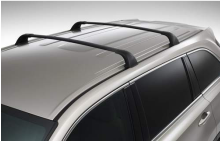
Cross Bars $387.50

The Cross Bars are engineered specifically to integrate with Highlander and Highlander Hybrid's factory roof channels, enhancing the vehicle's utility and cargo management versatility. The Cross Bars provide you with additional cargo space and can support a maximum load of 75 kg (165 lbs) when evenly distributed across both bars.