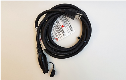
Premium Plug-In Block Heater - Optional 5.0m Home Power Cable $65.00

This custom-designed Block Heater not only warms your vehicle up quicker, but also reduces engine strain and wear. The system also helps to save fuel and battery power during startups, and the strain relief electrical cord reduces cord damage.