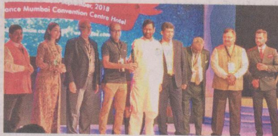
Freedom Healthy Cooking Oil team with the 'Globoil India Award for Emerging Brand 2018' on Saturday.

Globoil is a premier international conference and exhibition on Vegetable Oil, Feed & Feed Ingredients