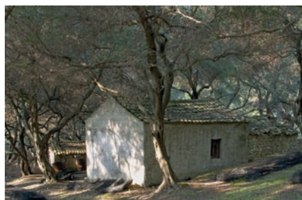
Kerkira, Corfu, Greece