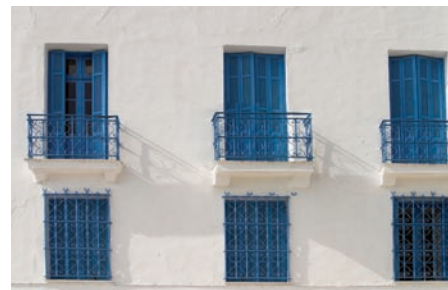
La Goulette, Tunisia