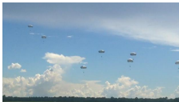
Top: Cadet Strong carries his equipment following a combat load jump