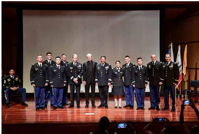
The Class of 2017