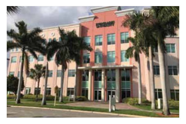
MIAMI CAMPUS (Off-Campus Instructional Site of the Boca Raton Main Campus) 11731 Mills Drive, Miami, FL 33183

5002 T-REX Avenue, #200 Boca Raton, FL 33431