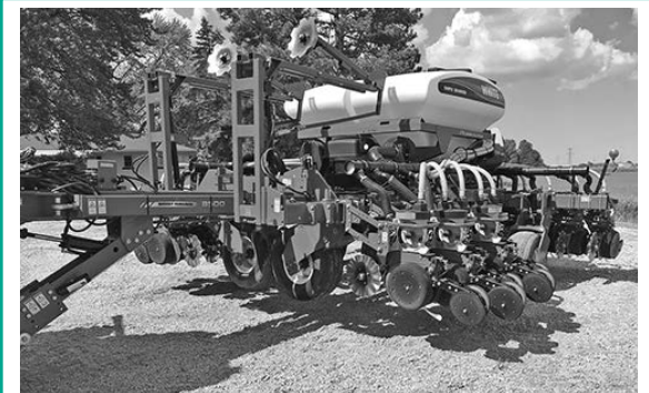
'08 Case IH 3208 28" corn head, $32,000 '10 White 8523 split row planter, central fill, no-till coulters, Keaton firmers, bean & corn plates & monitors, $62,000 (989) 397-2681