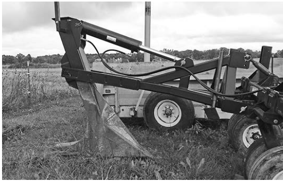
3-Pt. tile plow, 6" boot, 4' depth, 3-pt. cart not included, $8,000. (517) 525-6845