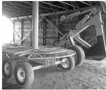
Johnson tile plow, new, never used, 5' working depth, plow cart, lasers, all new, $37,000 or best offer. (517) 202-9154