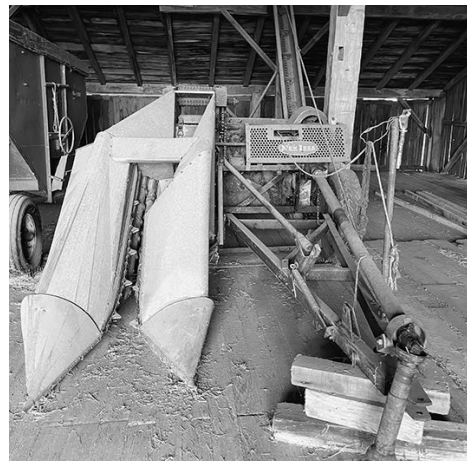
NI 310, 1R corn picker, stored inside, good cond., $1,650. More pictures avail. (616) 550-5100