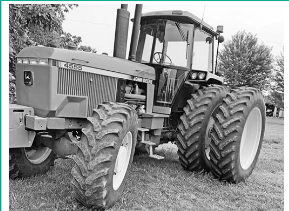
JD 4555, 7600 hrs., the hrs. might go up as we use it on our farm, good A/C & heat, has brand new int. kit. (616) 255-5025