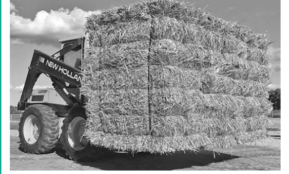
Clean wheat straw bales, regular size, strapped in bundles of (21) bales, easy to load, strap & haul, $3 ea. (810) 577-3159

'15 Bobcat E32, hyd. thumb, 19" bucket, 80% U/C, low hrs., $35,000 '13 Deere 50D, ROPS, new tracks, 4-way blade, $38,500 '18 Bobcat S570, cab, 2 spd. hi-flo, $35,000 '19 Cat 279D, A/C, new tracks, 79" bucket, 775 hrs., $70,000 '18 Cat 249D, cab, 80%+ tracks, backup camera, $40,500 '04 Deere 310SG CX4, 100% frt. tires, 50% rear, $32,500 '97 Deere 410E CX4, 24" rear bucket, $29,500 '06 Deere 310G, A/C, rear aux., 100% frt. tires, 50% rear tires, $36,500 '05 Deere 310G CX4, 18" bucket, low hrs., new rear tires, $38,500 '06 Case 580SM II CX4, A/C, aux. hyd., low hrs., $42,500 '04 Case 580SM Plus CX4, A/C, pilot, $36,500 '13 Skytrak 10054, solid tires, $45,000 '07 Skytrak 6042, foam filled tires, wide carriage, $38,500 '17 Kubota B26 T/L/B, 4x4, $28,000 '18 Kubota BX23S, $19,500 '17 Kubota BX23S, $18,500 Mid Michigan Services Company, Inc. 8458 Torrey Rd. Grand Blanc, MI 48439 (810) 655-2025 or Mobile (810) 348-4089 E-mail: mmsci@comcast.net Web: www.mid-michiganequip.com