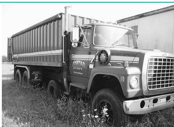
'84 Ford 8000 grain truck, Cat dsl., 10 spd., new spgs., clutch, muffler, 166,000 miles, 650-bu., Shurco tarp, $15,000. (810) 326-4565