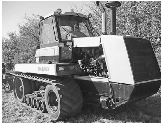
'90 Cat Challenger 65, 270 hp, new tracks, 5000 hrs., 10 spd., pwr. shift, $28,000. (810) 326-4565

'15 Bobcat E32, hyd. thumb, 19" bucket, 80% U/C, low hrs., $35,000 '13 Deere 50D, ROPS, new tracks, 4-way blade, $38,500 '18 Bobcat S570, cab, 2 spd. hi-flo, $35,000 '19 Cat 279D, A/C, new tracks, 79" bucket, 775 hrs., $70,000 '18 Cat 249D, cab, 80%+ tracks, backup camera, $40,500 '04 Deere 310SG CX4, 100% frt. tires, 50% rear, $32,500 '97 Deere 410E CX4, 24" rear bucket, $29,500 '06 Deere 310G, A/C, rear aux., 100% frt. tires, 50% rear tires, $36,500 '05 Deere 310G CX4, 18" bucket, low hrs., new rear tires, $38,500 '06 Case 580SM II CX4, A/C, aux. hyd., low hrs., $42,500 '04 Case 580SM Plus CX4, A/C, pilot, $36,500 '13 Skytrak 10054, solid tires, $45,000 '07 Skytrak 6042, foam filled tires, wide carriage, $38,500 '17 Kubota B26 T/L/B, 4x4, $28,000 '18 Kubota BX23S, $19,500 '17 Kubota BX23S, $18,500 Mid Michigan Services Company, Inc. 8458 Torrey Rd. Grand Blanc, MI 48439 (810) 655-2025 or Mobile (810) 348-4089 E-mail: mmsci@comcast.net Web: www.mid-michiganequip.com