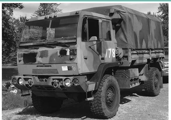
'95 Military cargo/flatbed truck, Cat 3116 turbo, 7 spd. Allison, 5,000 miles, 22,770 GVW, $14,500. (810) 326-4565

WANTED 3.9 4BT Cum. engs., running, take outs or rebuildable cores. Also buying injection pump cores We rebuild injection pumps & injectors Northern Power (231) 743-6817