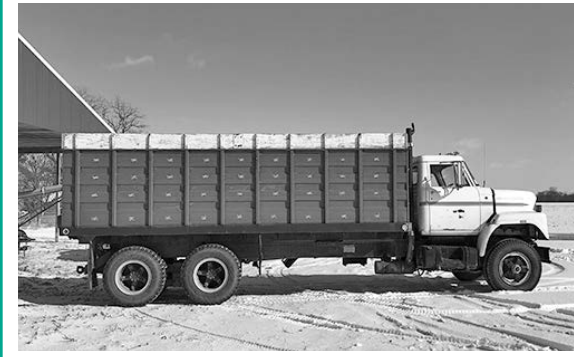
'73 Int'l. F2070, 22', Omaha bed, hoist, Det. (574) 633-4852