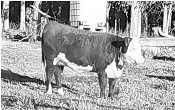
Hereford Heifer, scheduled for butchering on Nov. 8, 2021, Belingers, St. Johns, MI, $3/lb. HANGING WEIGHT plus processing. No texts (989) 798-4505