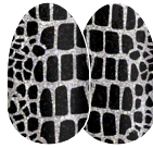
Hiss and Make Up