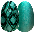
Snake My Day shimmer