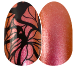
Wing It On shimmer