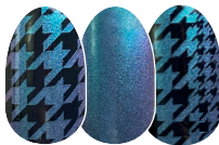
Suit Yourself shimmer