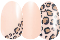
Trend Spotted creme