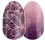
Rule of Plum shimmer