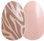
All Wild Up creme