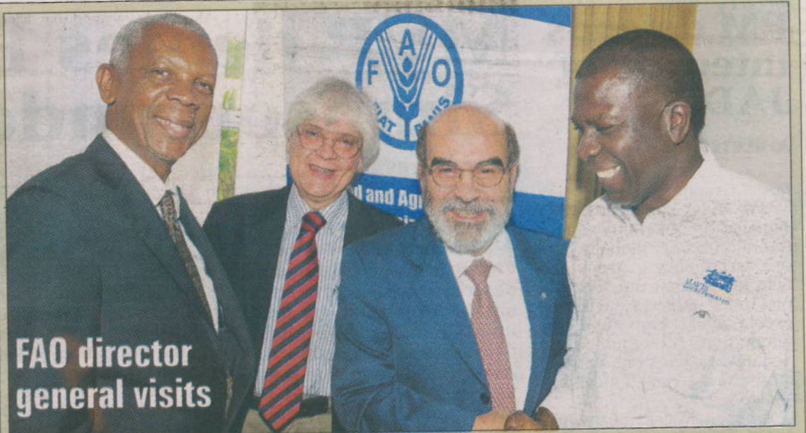
FAO director general visits