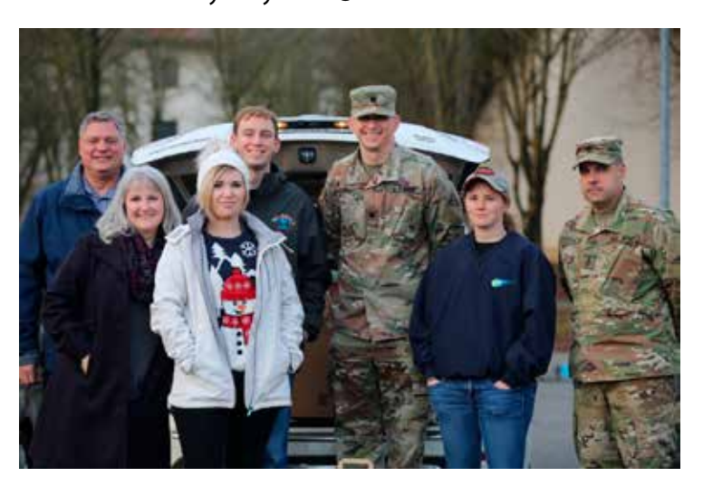
Members of the Hohenfels community pose for a picture before the Holly Jolly Hohenfels event in Hohenfels, Germany Dec 23,2019. This event provides Christmas cheer for single soldiers on Hohenfels who are away from their families.

If you do have a disabled dependent child when you retire, you may want to set up a Special Needs Trust (SNT) for the SBP annuity.