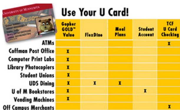
Marketing TCF’s U Card at the University of Minnesota

According to a leading industry survey conducted for the 2011 academic year, 151 schools had campus debit card/student ID programs with seven 12 leading banks. Higher One, a large non-bank financial firm, reported in its Securities and Exchange Commission (SEC) filing through March 31, 2012 that 520 campuses servicing more than 4.3 million students used its disbursement service; over 2.1 million of those students used its OneAccount debit account. 13