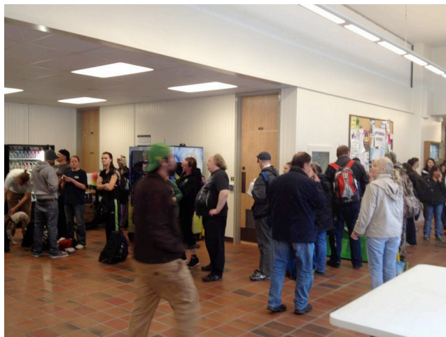
Line at the one of the two Higher One ATMs at Lane Community College (OR) as spring quarter classes start, April 2012. Line continues in both directions where picture ends, totaling around 50 students. Both ATMs ran out of money by lunchtime.

The Department of Education has established rules that prohibit fees to access student aid money disbursed to a debit card on ATMs as long as the issuing bank provides conveniently located fee-free ATMs. 21 However, the rules specifically allow the bank to charge foreign ATM fees when students use other machines. The current rules do little to define what “conveniently” located means in terms of location or number of ATMs, as well as cash availability in the ATMs when disbursements arrive. The rules do not protect students from situations in which they are charged money to access their aid funds. The rules do not protect students from changing terms and conditions that impact fee structures and can affect their ability to access their aid freely and conveniently.