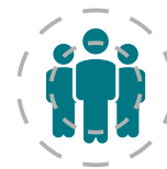
TRADE AREA POPULATION