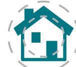
TRADE AREA HOUSEHOLDS