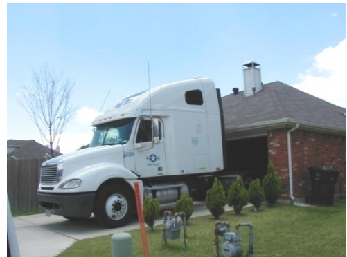
Commercial vehicle parked in residential district

Commercial vehicles weighing more than twelve thousand pounds (12,000) cannot be parked on a residential road or highway between 12:00 midnight and 6:00 a.m. of any day, except in an emergency. Tractors, tractor-trailers, or tractor trailer truck units cannot be parked on any residential road, except while loading or unloading. A standard sized van or pickup, even with commercial markings, is allowed to be parked in residential areas if it is used during regular business hours.