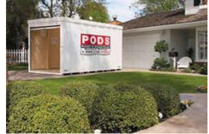
PODS container placed on a driveway

PODS is an enclosed, portable storage container that is delivered to a person’s home for the purpose of moving or storage. Once the PODS is filled with its contents, it is either delivered to its destination or sent to a storage facility. After fourteen (14) days, a PODS container is considered to be a portable shed and, therefore, is subject to St. Louis County ordinances that regulate sheds, including the permitting process for sheds. For County ordinances regarding sheds, please see Sheds/Exterior Storage.