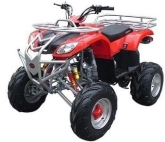
All Terrain Vehicle (ATV)

Contact: St. Louis County Police Department Non-emergency reporting/ General information (314) 889-2341 TDD (314) 889-2345