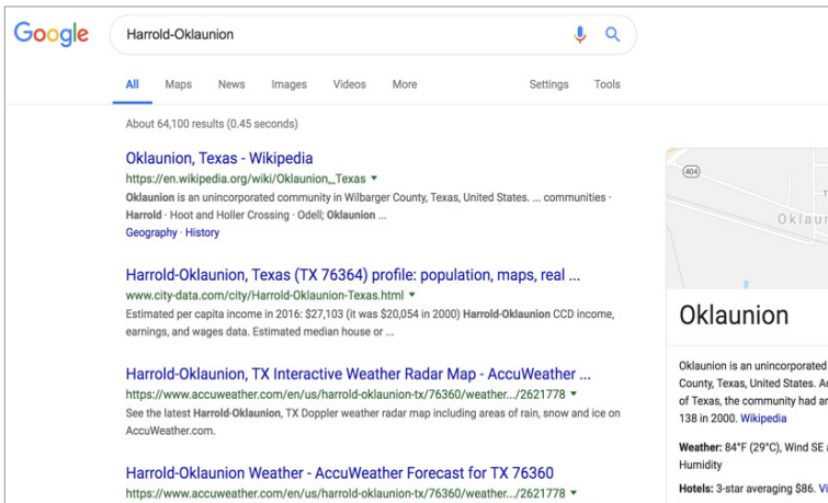
Figure 2: Until the shooting, a search for “Sutherland Springs Texas,” returned results that mirror Harrold-Oklaunion’s. This was a data void, but one with no consequence until the attack.

As best we can tell, no one had searched for this town for years. Moreover, there was almost no information on the web about this town. To understand the dearth of information at that point, consider the search results for “Harrold-Oklaunion” (another small town in Texas) in summer 2019. Both Bing and Google promise you tens of thousands of results, but the information you see is primarily algorithmically generated content provided by services like Accuweather.com, City-Data.com, Yellowpages.com, and Acrevalue.com. There is a smattering of links to Wikipedia entries, news stories, and court records, but the “most relevant” content provides little information in a breaking news context. Data voids like this are not vulnerable until something happens.