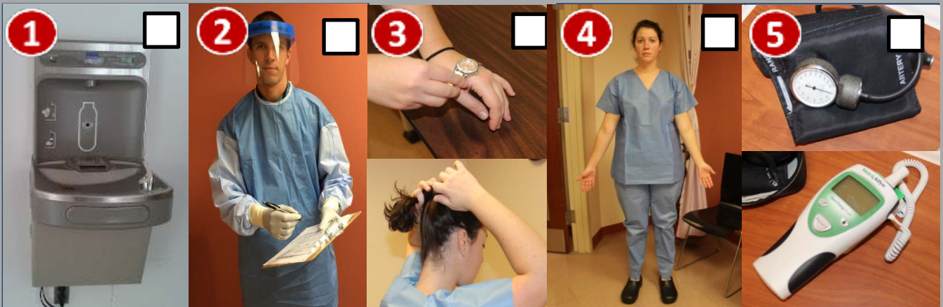
1 Hydrate. 2 Engage trained observer. 3 Remove all personal items. Tie back long hair. 4 Put on scrubs and washable footwear. 5 Take and record vital signs.