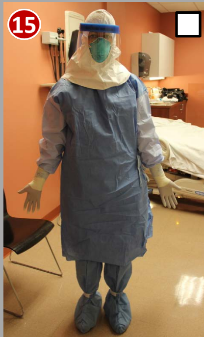
15 Trained observer verifies all PPE properly fitted.

! If the patient's condition warrants, additional personal protective equipment may be added to these guidelines. This may include items such as Tyvek suits, powered air purifying respirators, and aprons. !