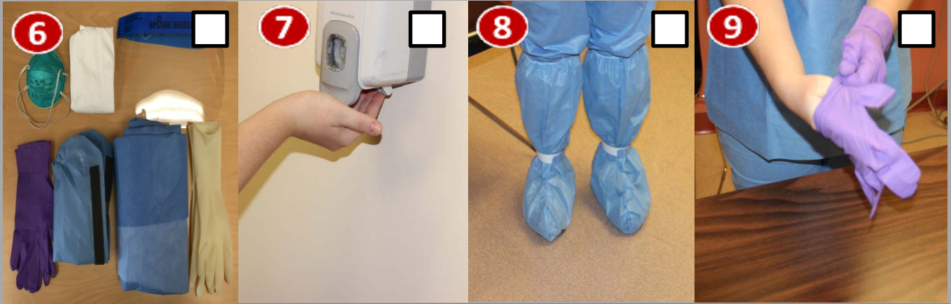
6 Inspect PPE supplies. Review donning sequence. 7 Perform hand hygiene. 8 Put on boot covers 9 Put on standard patient care gloves.