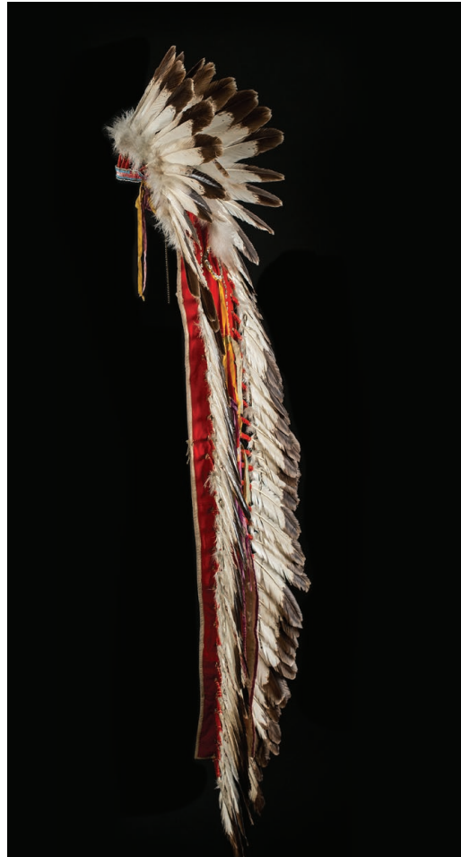
Sicangu (Brulé) Lakota wapaha , or eagle-feather headdress

South Dakota ca. 1880 Eagle feathers, eagle downy feather, wool cloth, cotton cloth, silk ribbon, porcupine quill, glass beads, hide thong, metal chain, cotton/sinew thread.