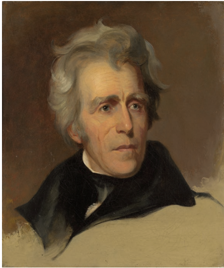
Andrew Jackson, 1845