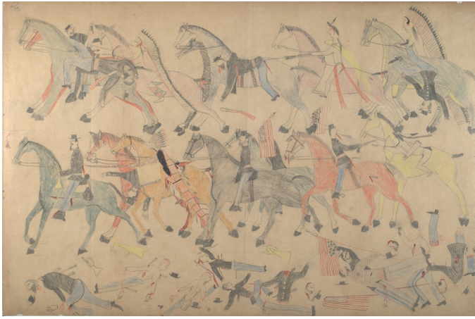
Battle of Little Bighorn, 1881

Red Horse (Miniconjou Lakota) National Anthropological South Dakota Archives, Paper, graphite, colored pencil, Smithsonian Institution NAA ink MS 2367-a