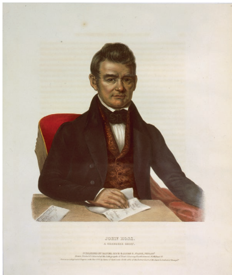
John Ross, A Cherokee Chief , 1843

In the early 1800s a vigorous debate consumed the country. Should Indians be removed from the Southeast? Opponents of removal argued for the inherent sovereign rights of Native nations. Those in favor asserted that Indians hindered economic progress, and that removal was humanitarian. The debate again and again questioned removal's cost, to American Indians and to the country's soul. Even the act's hardline advocates knew it should at least pretend to honor American values. The United States knew that removing American Indians from their sovereign territories could damage its reputation as a new democracy. The contradiction between democratic values and Indian removal is why the act was so ferociously debated, why it cost so much and took so long, why it was forgotten for half a century, and why it is burned into national memory.