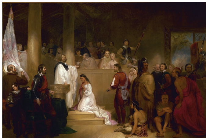
Baptism of Pocahontas, 1839

In 1924 Virginia debated the Racial Integrity Act. The law required all Virginians to be identified as either white or colored. It defined as white a person who had “no trace whatsoever of any blood other than Caucasian.” It also legislated Indians out of existence, since it eliminated the category. When the act passed, it included a provision. Those with 1/16th Indian blood would be classified as white. Now known as the Pocahontas Exception, the clause catered to families who descended from Pocahontas and John Rolfe. This permitted aristocratic Virginians to have it both ways: they could claim Indian blood from a cherished ancestor and also remain legally white.