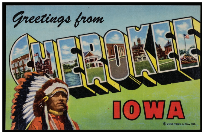
Greetings from Cherokee, Iowa, postcard, ca. 1949