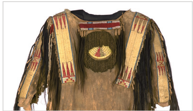
Lakota shirt, ca. 1875

Lakota, Cheyenne, and Arapaho leaders earned respect by building consensus and fostering unity. On the northern plains, warfare was focused on intelligence, leadership, and achieving war honors. Successful warriors, essential to the survival of their societies, were held in high esteem.