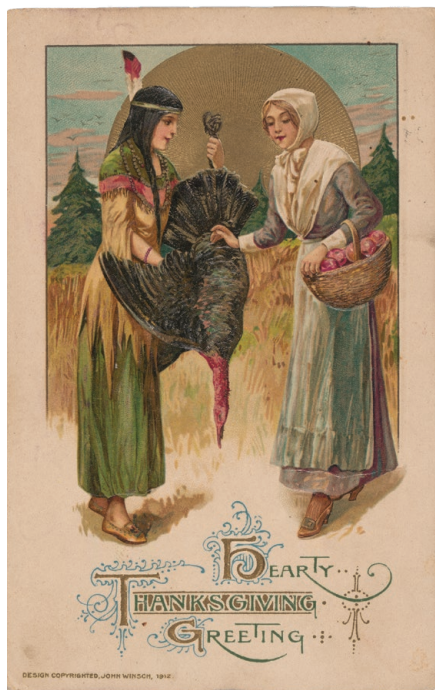
Thanksgiving postcard, ca. 1912