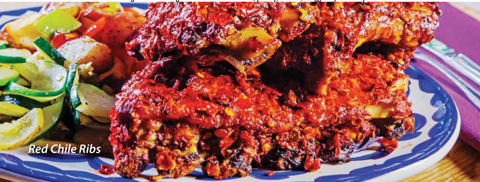
Red Chile Ribs

⊘ Grass Fed Burger* ..... 14.49 8 oz. patty, from pasture raised cattle that are source verified (no hormones, antibiotics or feedlots), charbroiled, and served with a side of El Pinto fresh guacamole and fries. Garnished with lettuce, tomato, red onion and a pickle slice. Add cheese .50; chopped green chile .50; bacon +2.