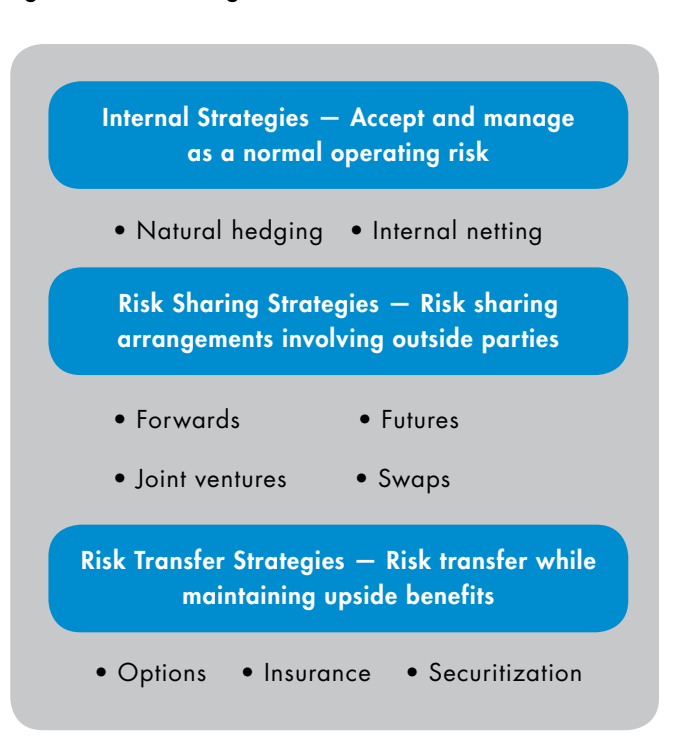
Figure 2: Risk Strategies and Tools

The key to successful risk management in any organization is creating a risk-aware culture in which risk management becomes embedded within the organizational language and methods of working.