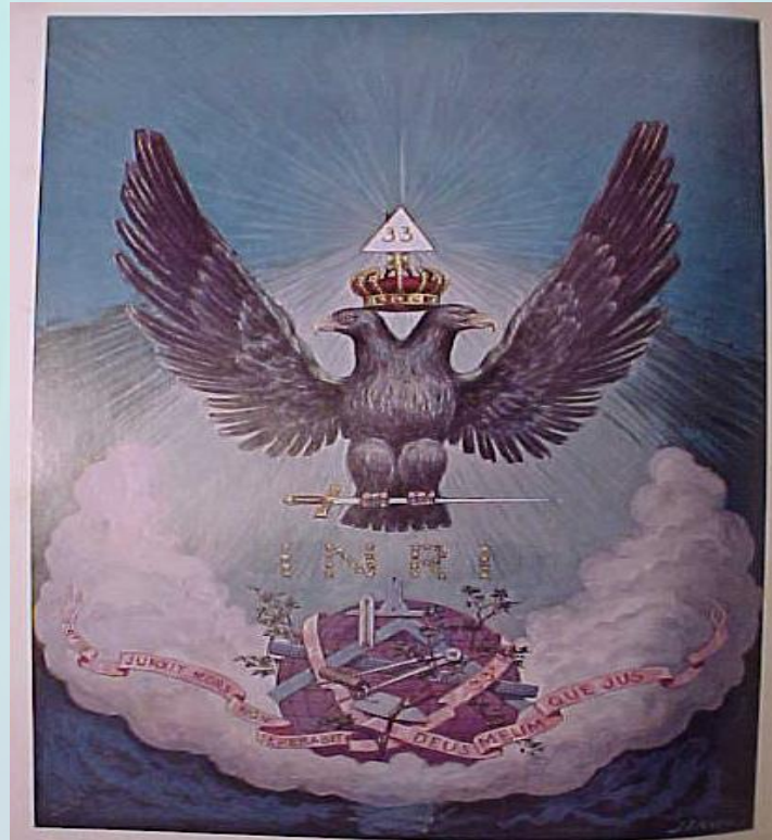
33° - Sovereign Grand Inspector General