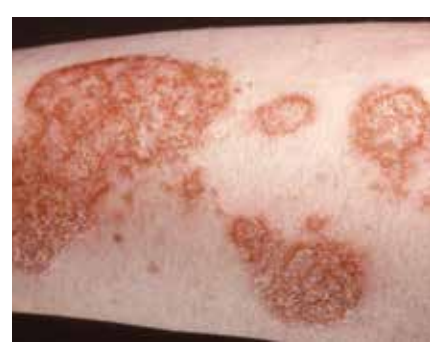
Discoid/nummular eczema with round or oval, blistered or dry skin lesions.

Discoid eczema affects males and females equally. It can occur at any age, including childhood, but tends to affect women in early adulthood, whereas male onset is more common in older age groups. Discoid eczema is more likely in people with atopy and those with infected eczema and allergic contact dermatitis.