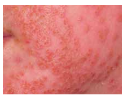
Eczema herpeticum requires immediate antiviral treatment and an appropriate referral (dermatology/ophthalmology), as it is one of the few dermatological emergencies.

IV aciclovir. Eczema herpeticum is a medical emergency that requires prompt, same-day treatment.