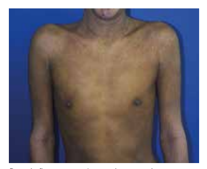
Post-inflammatory hyperpigmentation (dark) and hypopigmentation (light). It may take 6–12 months or longer for normal skin colour to return.