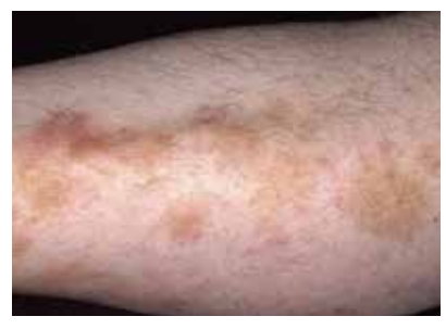
Varicose/gravitational/stasis eczema on the leg of an elderly patient.

Varicose eczema affects the lower legs. The skin becomes thin, fragile, shiny, inflamed, itchy and flaky. The eczema can arise as discrete patches or affect the leg all the way around, often with exudating areas around the ankles. This type of eczema is often accompanied by other manifestations of venous hypertension, including dilation or varicosity of superficial veins, oedema, purpura,