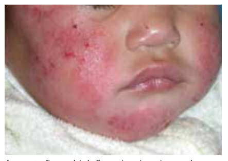
An acute flare with inflamed, red, and sometimes blistered and weepy patches indicates a secondary bacterial infection.