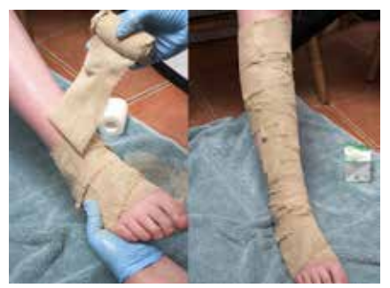
Paste bandages are applied using pleats to allow more freedom of movement and to compensate for shrinkage as the bandage dries out.

Impregnated paste bandages can be useful for treating eczema of the limbs, especially chronic and/or lichenified eczema.