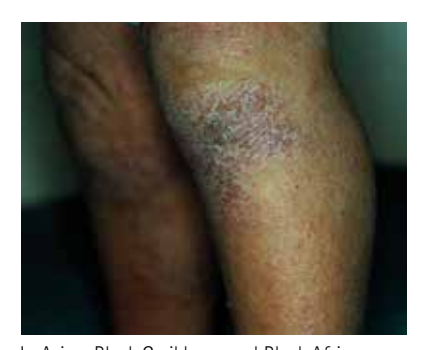
In Asian, Black Caribbean and Black African patients, atopic eczema can affect the extensor surfaces rather than the flexures.