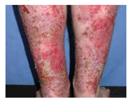
A bacterial infection (staphylococcal) with oozing and crusting on an adult's lower legs.

within 5 days), it will be necessary to switch to oral antibiotics. Systemic antibiotics should be prescribed for 7 days in line with local antibiotic guidelines and then reviewed.