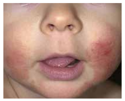
Faces are a common site for atopic eczema in babies, with cheeks often the first place to be affected.