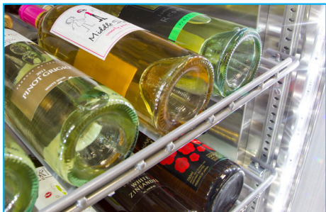
Wine shelves only available for VLD models.