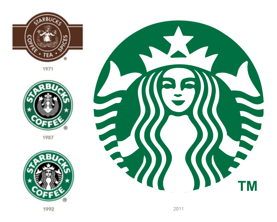
Figure 5: Starbucks logo evolution from 1971 to 2014

The use of the logo at Starbucks is crucial since it can be found on every product and is nearly recognised by all individuals worldwide; created in 1971 it has evolved during the years. As Brassington and Pettitt (2006) explain, the logo and brand name must be distinctive, supportive, acceptable, and available. Despite the fact that Starbucks is a freestanding brand name (the name does not describe the product) customers still link it directly to the products and services provided. The logo has been simplified over the years in order to be more easily recognizable. As Dooley (2012) discovered, the less detail you utilize, the more likely the customer will remember it. The evolution can be noticed below: