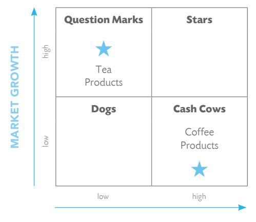
RELATIVE MARKET SHARE