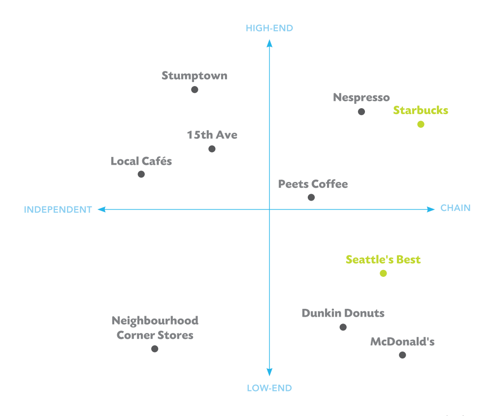
Figure 1: Starbuck's Positioning

At Starbucks, the demographic segmentation's main group is between 25 and 40 years of age with high incomes, the second target group is 18 to 24 year of age and belongs to richer families. In general, the customers belong to the Generation Y born between 1977 and 2000; this is where most profit is made as claimed by Fromm (2014). Psychographic segmentation indicates that customers belong to the upper-middle class and generally have college education (Rafii, 2013). When targeting, Starbucks is situated between mass marketing and segment marketing; they are targeting a broader public; however, there are some criteria that the customers should have, such as higher incomes or a younger age. We can illustrate Starbuck's positioning thanks to the graph (Zapolski, 2010) below; it is how the customers perceive the product and service sold.