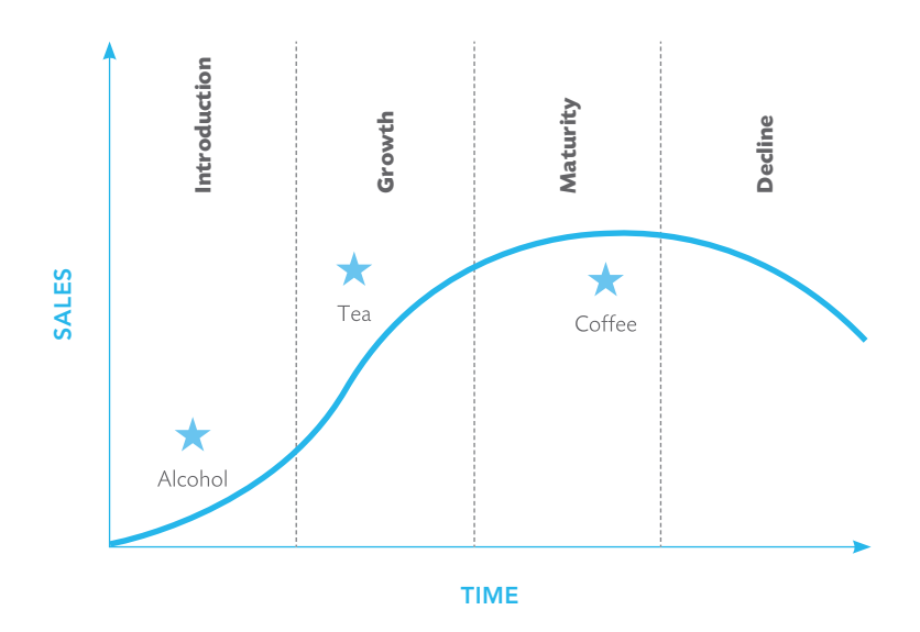
Figure 4: Product life cycle of Starbucks tea & coffee

By using the Product Life Cycle curve, product management understands which products they are selling and are therefore able to determine their value. It is the product management's job to transmit these product traits to the customer in order to create value. At Starbucks the core product is a hot or cold beverage, the tangible product is tea or coffee, the augmented product is the tangible good in combination with the personalised friendly service and the potential product could be the evolution of the product portfolio towards other beverages such as alcoholic drinks. Represented on the PLC graph, Starbucks' products would look as follows: