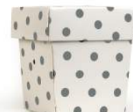
SILVER POLKA DOT