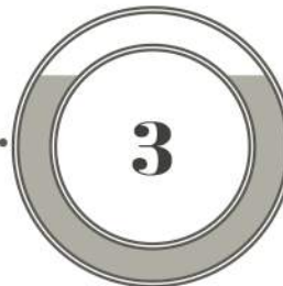
CHOOSE YOUR BOW