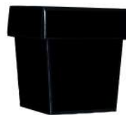
PLAIN BLACK BOX