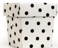
BLACK POLKA DOT