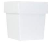
PLAIN WHITE BOX