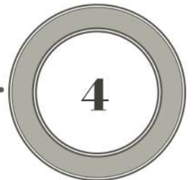
SEND YOUR LOGO