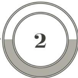
CHOOSE YOUR BOX