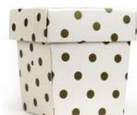
GOLD POLKA DOT