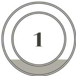
CHOOSE YOUR FRAGRANCE