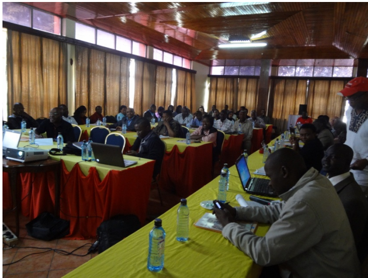
Representatives of various CSOs at the National CSO consultations in Nakuru, Kenya

The Ministry held a consultation forum for National CSOs in June 2013. The forum drew participants from about 54 civil society organizations with programmes in various sectors. There was a CSO representative from the each of the county consultation forums held earlier in April 2013.