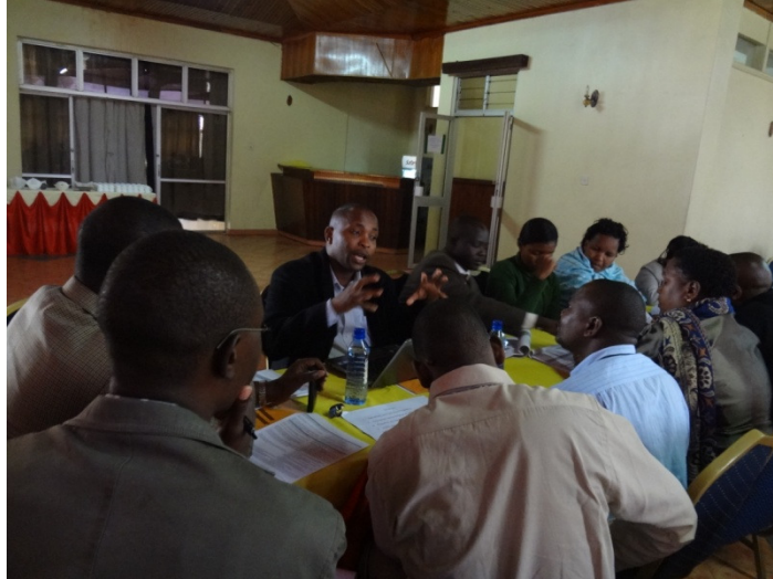
Participants engage in group discussions during the National CSO consultations

The following were identified as the key issues to be considered: