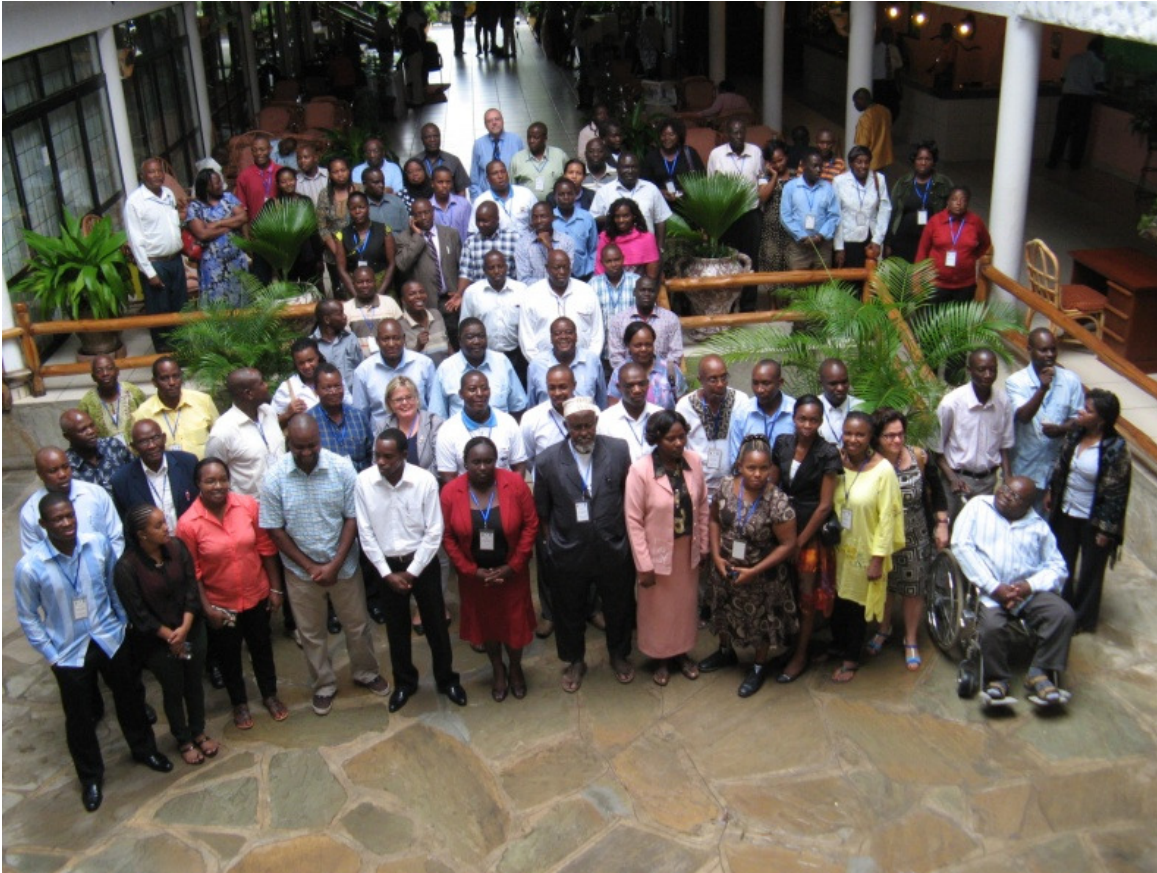
Group photograph of participants at the National consultation forum