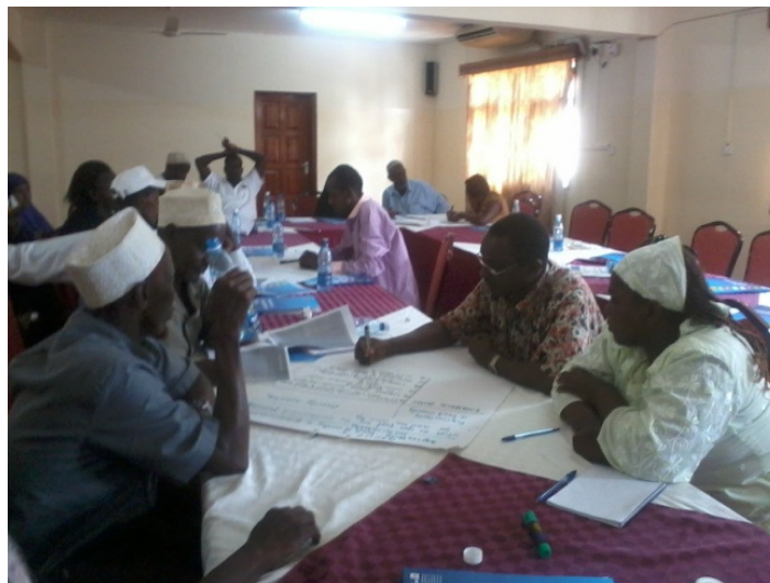
Participants at the county consultations in Garissa County

Equitable distribution of health resources (finances, human, facilities and services) Non-Communicable Diseases (Cancer, Diabetes, high blood pressure) and Social protection for the older persons and people with special needs were identified.