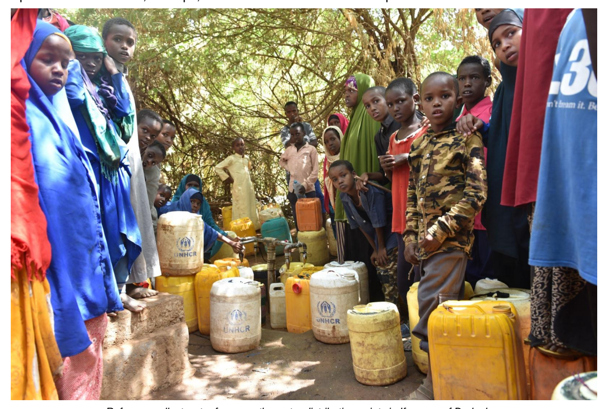
Refugees collect water from one the water distribution points in Ifo camp of Dadaab.

During the reporting period, UNHCR supplied on average 31.6 liters of water per day per capita from 22 boreholes to the entire refugee population in the three Dadaab camps. Nineteen (19) of these boreholes operate on Solar PV- Diesel hybrid system. The water supply schemes convey water to 38 tanks with a total storage capacity of 4,550 m³, distributed through a pipeline network of 235 km and relayed to 668 tap stands with about 2,784 taps, scattered around the three camps.