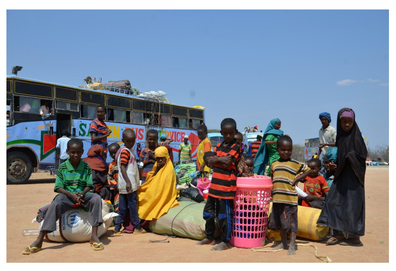
Refugees returning to Somalia under UNHCR voluntary repatriation Program.