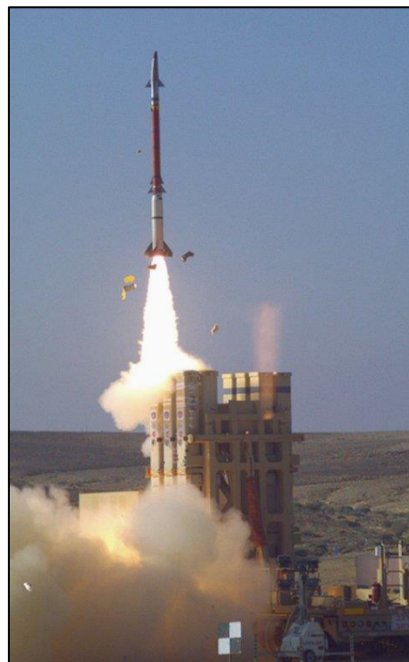
Figure 6. David's Sling Launches Stunner Interceptor

Since FY2006, the United States has contributed over $1.9 billion to the development of David's Sling (see Table 4 ). In June 2018, the United States and Israel signed a co-production agreement for the joint manufacture of the Stunner interceptor. Some interceptor components are built in Tucson, Arizona, by Raytheon.