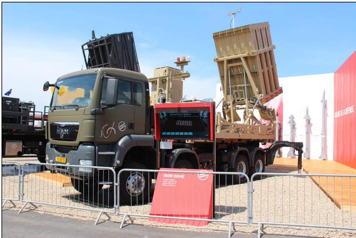
Figure 5. Iron Dome Launcher