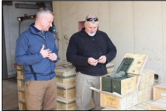
Figure 7. Army Officers Inspect WRSA-I