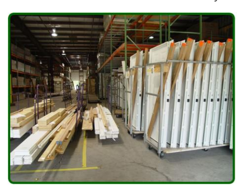
Ponderosa maximizes the efficiency, speed and accuracy of warehouse operations and helps drive costs from your business.

The Ponderosa WMS also supports manufacturing, remanufacturing and production scheduling to optimize manufacturing processes, material movement, work centers, labor, overhead costs and allocated inventory. The result is reduced labor costs, increased