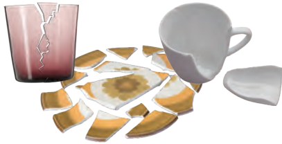
Broken Glass & Ceramics