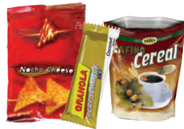
Food Wrappers, Pet food Bags