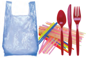
Plastic Bags, Straws & Utensils