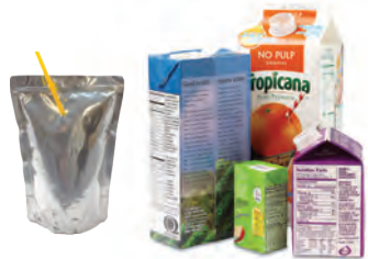
Juice Pouches/Boxes, Cartons (with plastic tops)

Do not place Household Hazardous Waste or electronic waste in the trash cart. For proper handling, please see the Household Hazardous Waste panel.