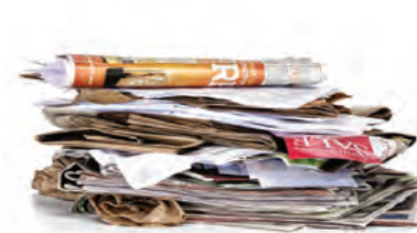
Paper. Flattened Cardboard & Paperboard

Flatten all boxes (do not bundle/tie up)