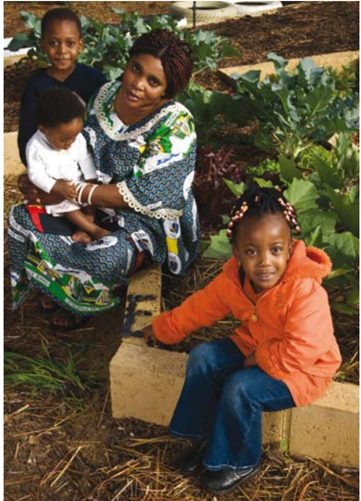
'E' is for Ellie's eggplants.

Help your child hear the strong sounds at the beginning and end of words, such as stp for stop or cr for car. You can also help your child by showing them common spelling patterns such as 'ed' and 'ing'.