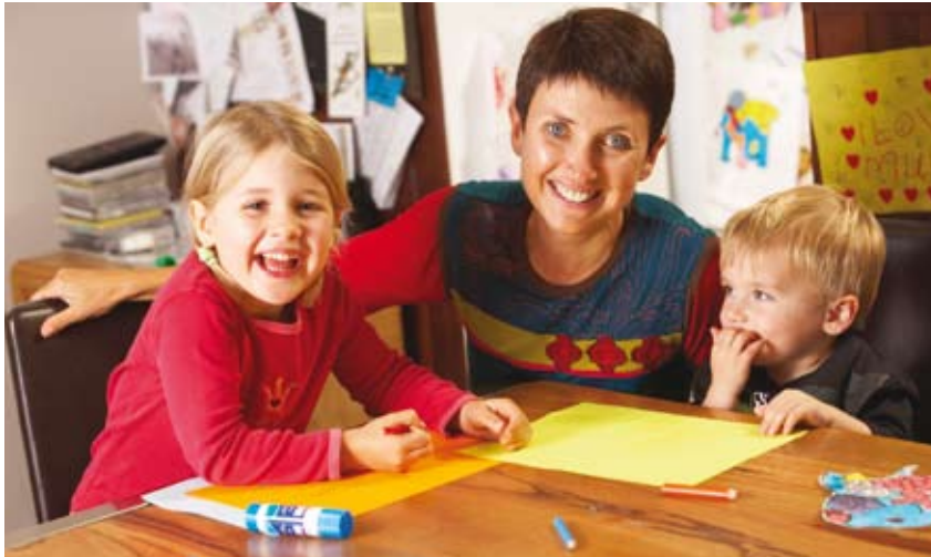
Learning to write is exciting.