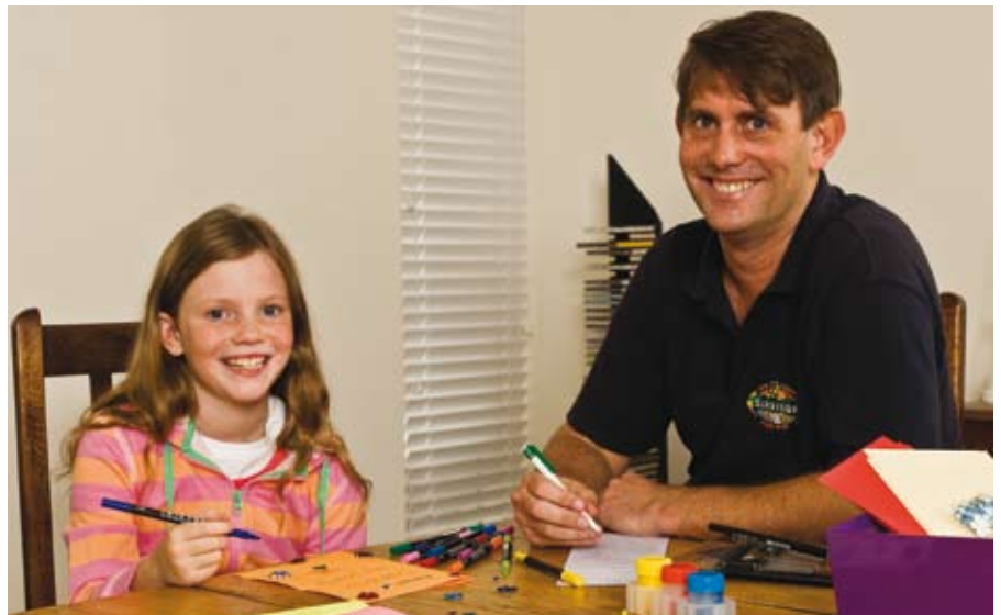
We are making party invitations.

See if you and your child can find words which read the same from the front or the back. For example, dad , pup and madam . These are called palindromes.