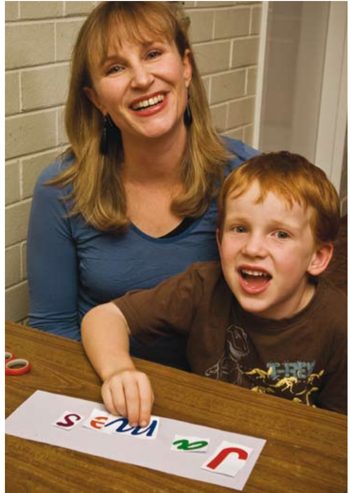
The 'm' fits in the middle.

Try re-arranging the letters in words to make other words. Ask your child to find some, starting with easy words and going on to harder ones. For example on → no; dad → add; art → rat, tar; tabs → bats, stab. These are called anagrams.