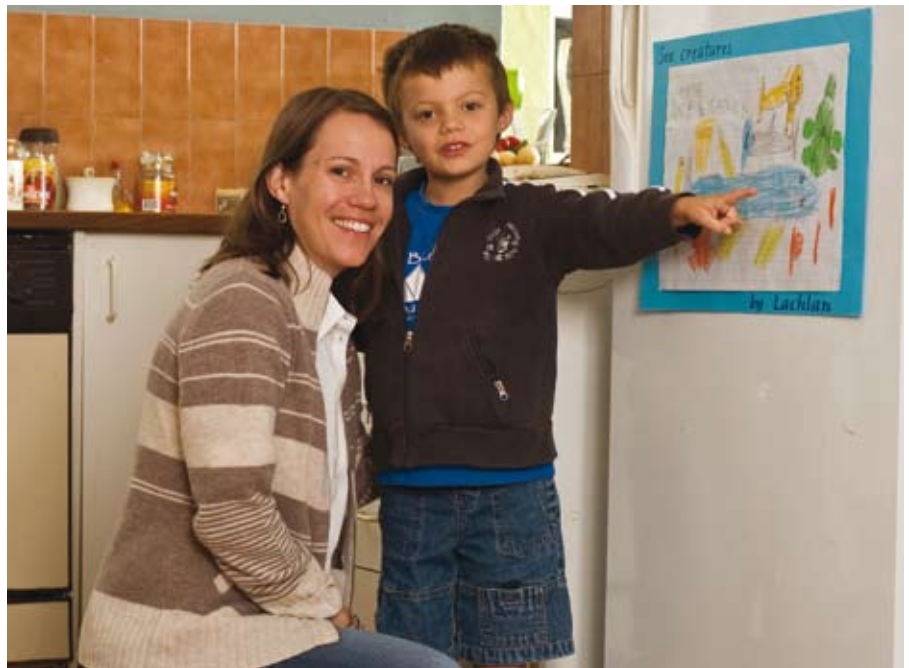
We are talking about the 'Sea creatures' story.

Turn off the TV. It's easier for your child to concentrate if there are no distractions.