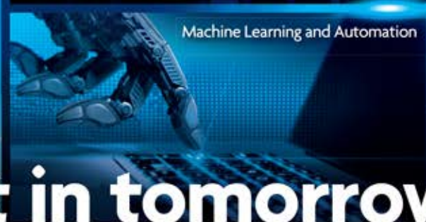
Machine Learning and Automation