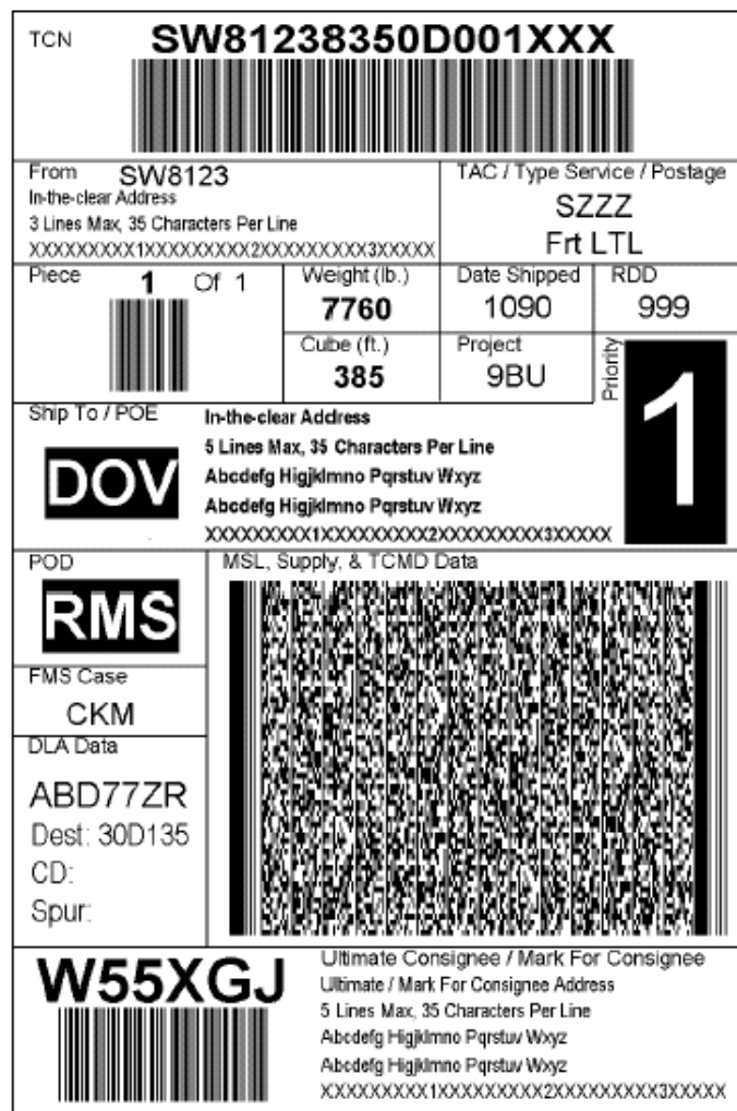
Figure C-1. Sample MSL

This 2D symbol contains data for the MSL, TCMD, and 10 supply line items.