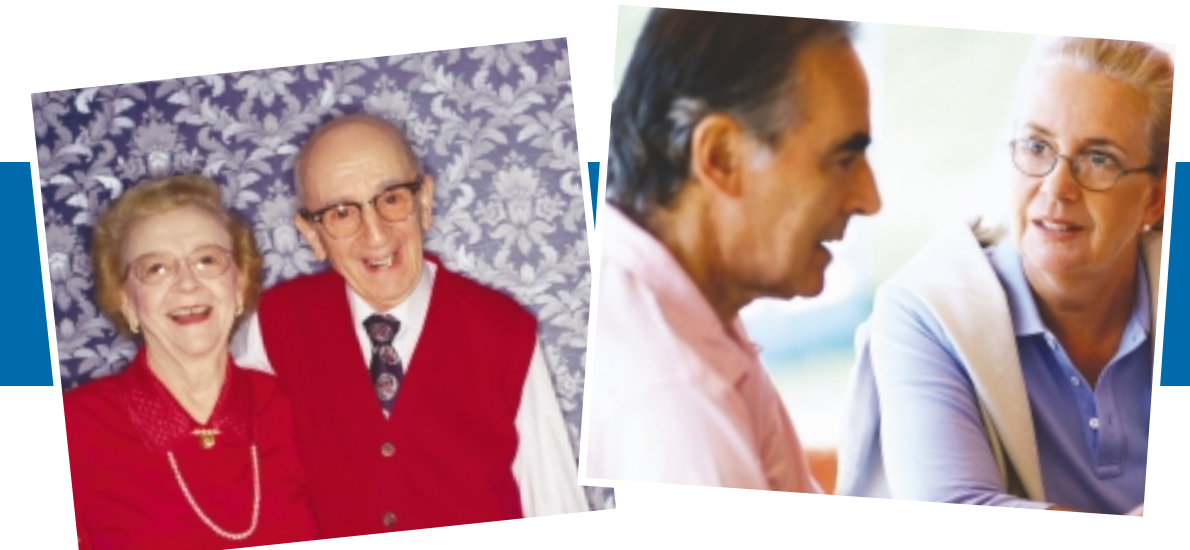
The foundation of an older adult ministry must be built on evangelism.

adult ministry. Leaders are readers, and it is important to seek out books and articles on this subject.