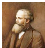
James Clerk Maxwell

Earlier this year I asked readers to send me their shortlists of great equations. I also asked them to explain why their nominations belonged on the list and why, if at all, the topic matters ( Physics World May p19).