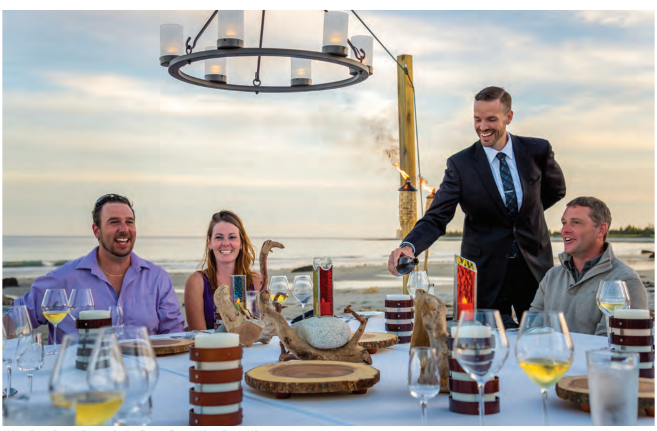
White Point Beach Resort, Stellar Beach Feast, White Point, NS