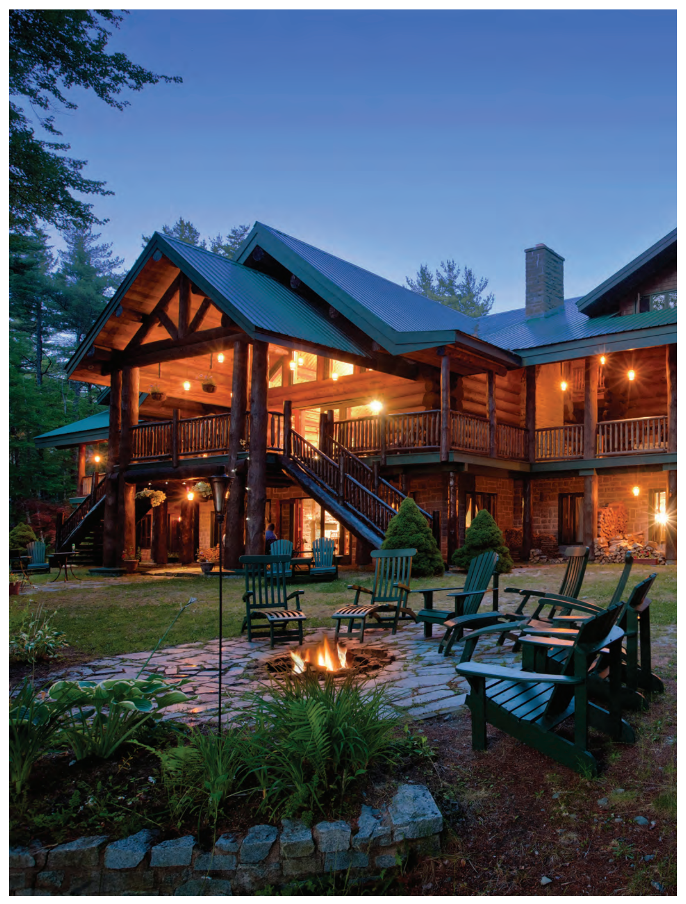
Trout Point Lodge, East Kemptville, NS