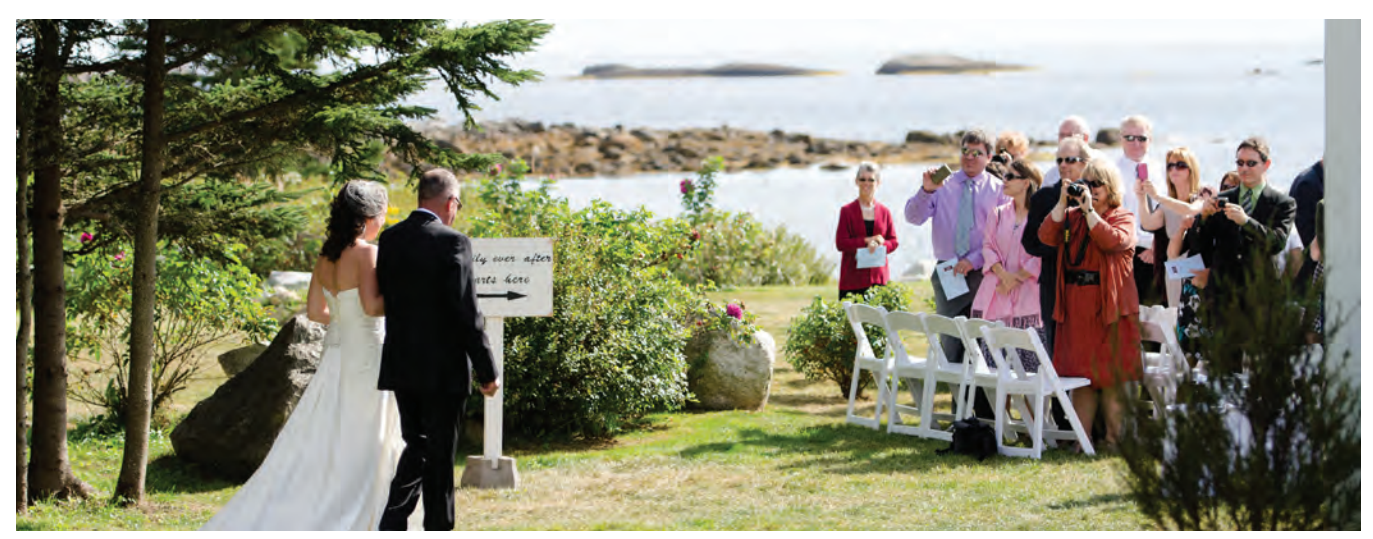
Oceanstone Resort, Indian Harbour, NS

http://www.hitched.ca https://www.weddingwire.ca https://www.eventective.com