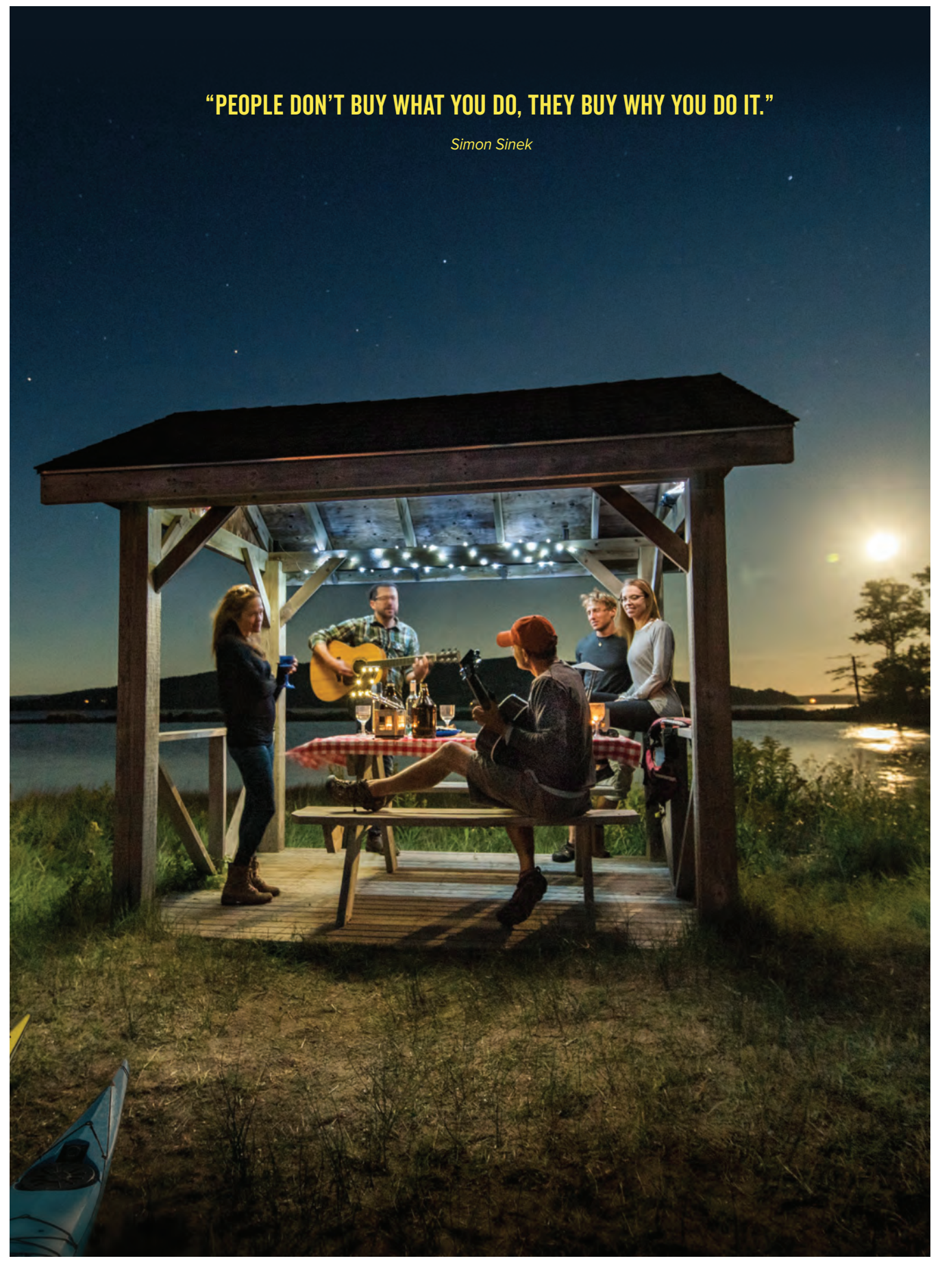
North River Kayak Tours, Lighthouse Bites: Full Moon Adventure, Baddeck, NS