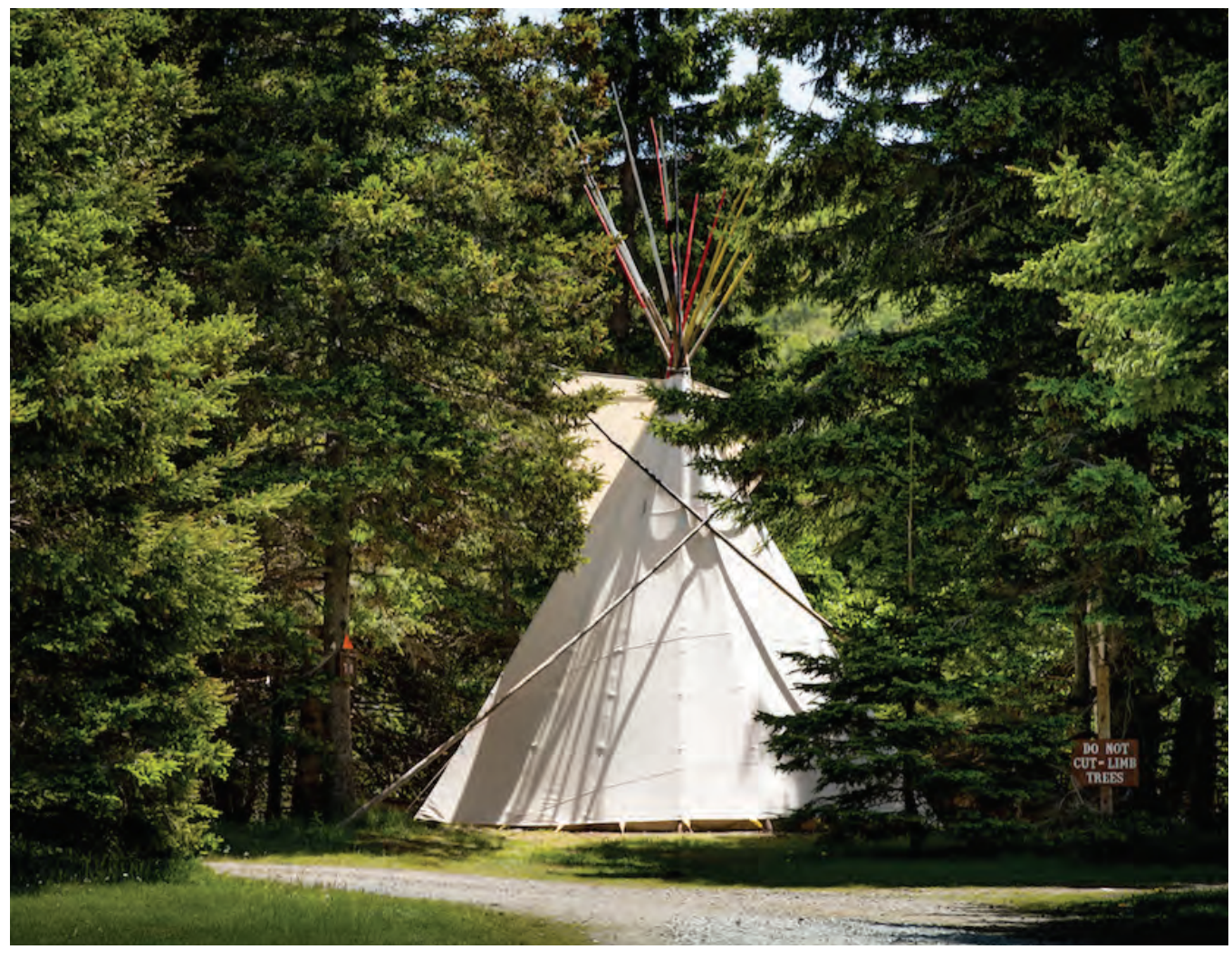
Kluskap Ridge RV & Campground, Englishtown, NS