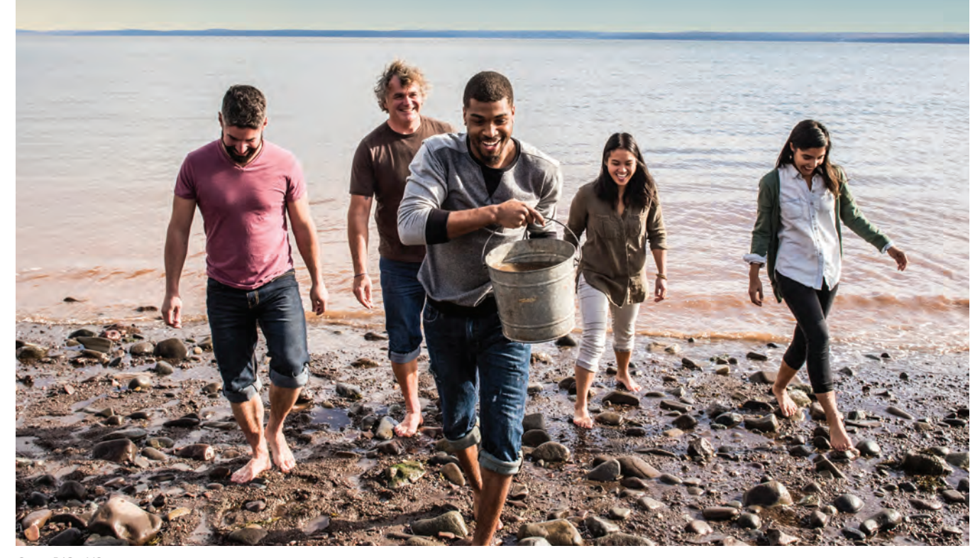
Cape D'Or, NS