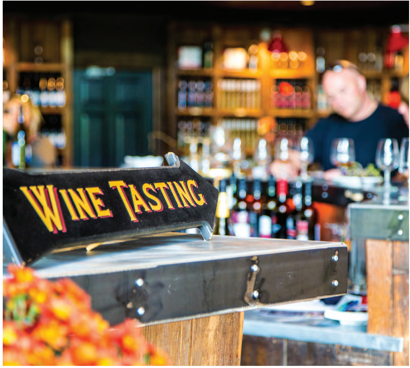
Jost Vineyard, Malagash, NS

personalized service to give our visitors the most incredible and memorable experience of Nova Scotia.