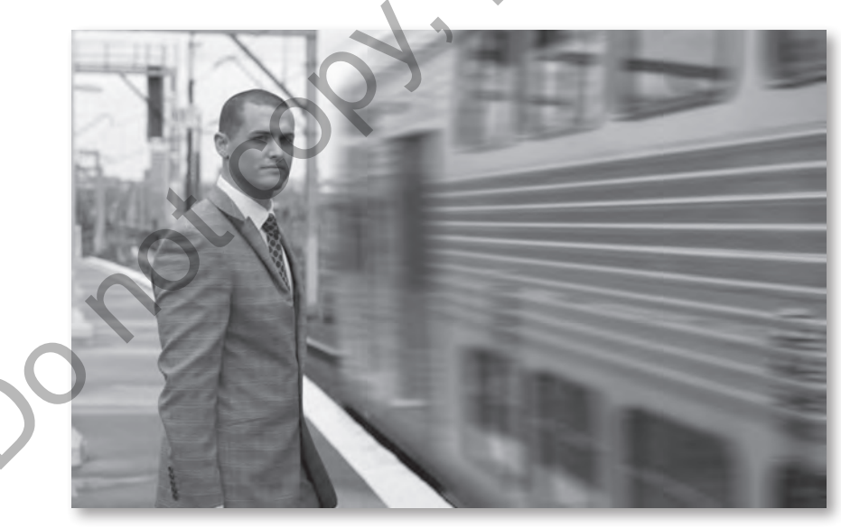
Photo 2.4 An environment that is accommodating creates a better society where everyone can function independently.

Theories of development classified as ecological theories emphasize environmental factors. One ecological theory that has important implications for understanding life-span development was created by Urie Bronfenbrenner. Bronfenbrenner (1917–2005), a Russian-American, developed the Ecological Systems Theory of human development. According to the theory, a child's development occurs within a complex system of relationships including parent-child interactions (i.e., the microsystem); the extended family, school, and neighborhood (the mesosystem); and the general society and culture (the exosystem). All in all, the theory posited five environmental systems significant for understanding human development: microsystem, mesosystem, exosystem, macrosystem, and chronosystem. Table 2.4 provides descriptions of these systems, whereas Figure 2.1 highlights the dynamic interactive nature of these systems.