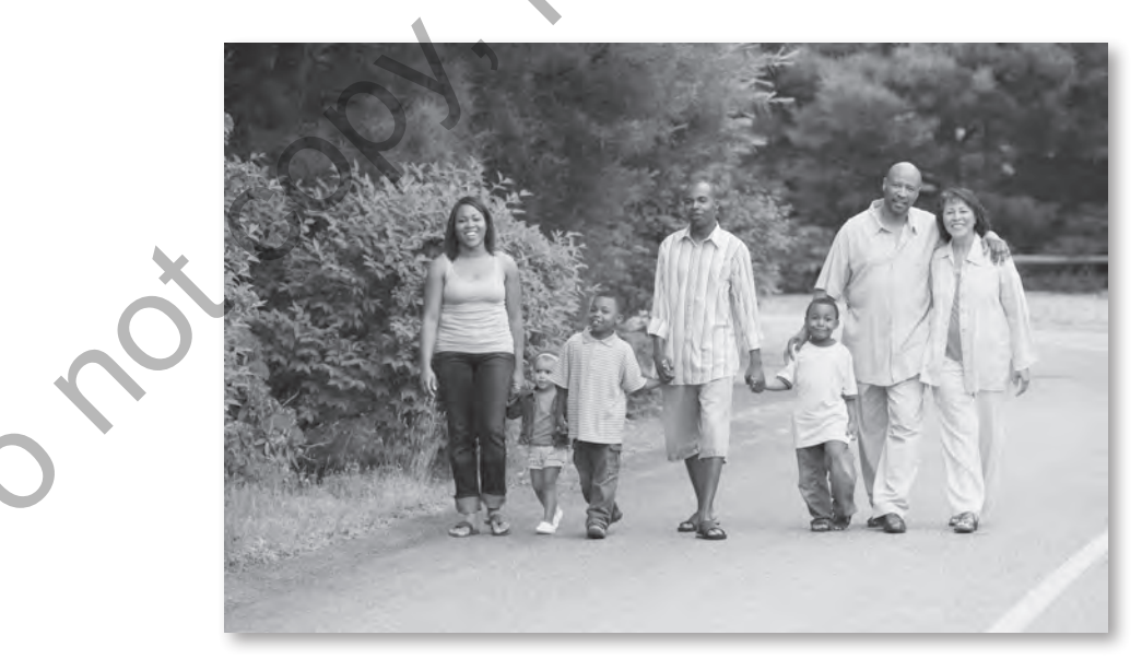
Photo 2.3 Strong intergenerational family bonding is very important throughout the lifespan of family members.