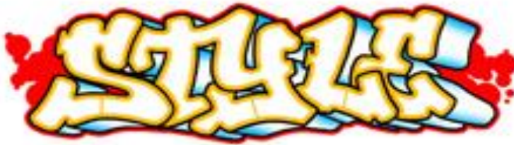
Softy Letter style