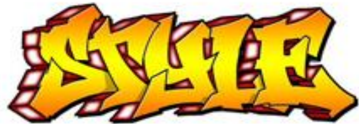
Wiggles Bboy style