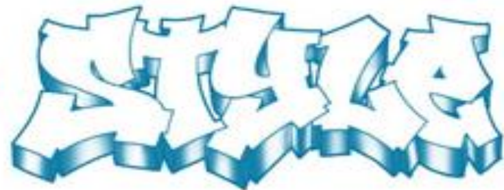
Chinese Graff style