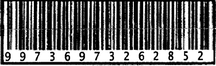
Figure 6-1. Sample labeling of records