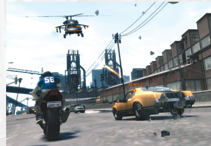
Co-op Hangman's NOOSE Deal Breaker Bomb da Base II