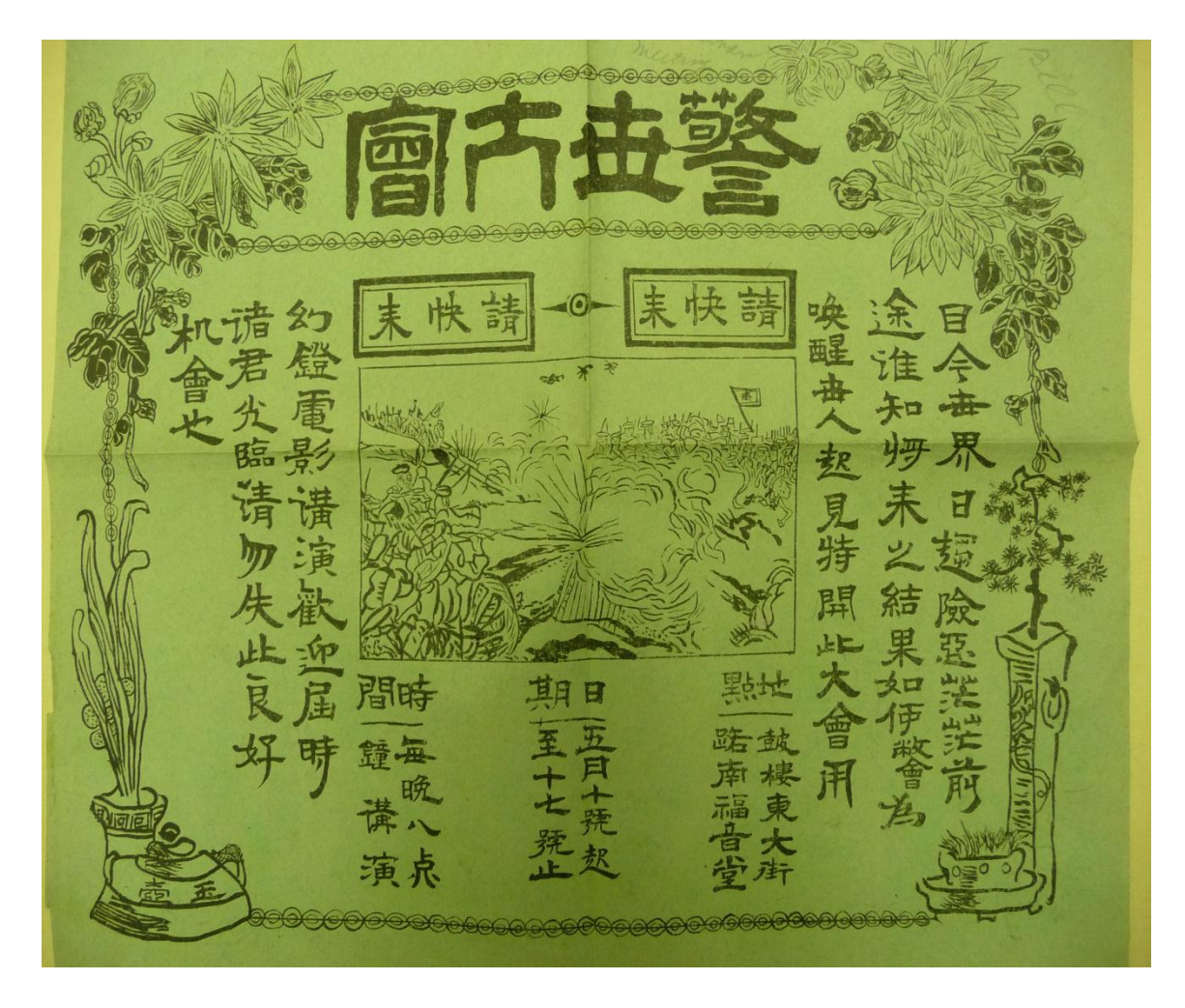
Figure 1: An Adventist's meeting flyer, Beijing, 1910s

In structure, the Adventist missionary movement in China was highly centralized and hierarchical. By the mid-twentieth century, all the congregations, schools and institutions were divided into seven regional unions under the China Division, the Adventist mission headquarters in Shanghai. Funded by the General Conference of the Seventh-day Adventists in the United States, the China Division and most regional unions were chaired by the missionaries. This administrative hierarchy created a subordinate relationship between the missionaries and Chinese staff when most of the missionary enterprises indigenized their leadership and became more self-supporting. A major strength of this centralized model was that Chinese Adventists could easily access American missionary