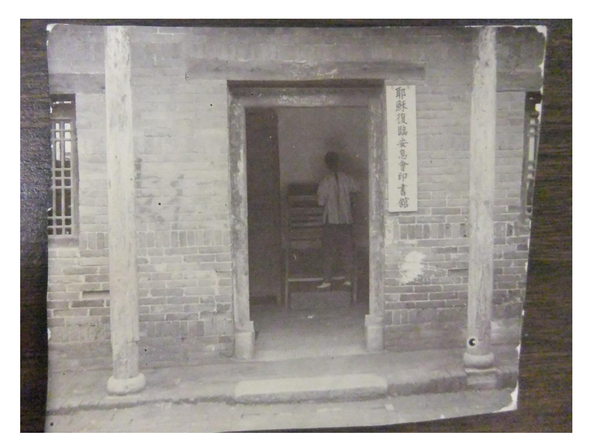
Figure 2: A Chinese Adventist Publisher, 1900s