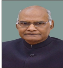
Hon'ble President of India Shri Ram Nath Kovind