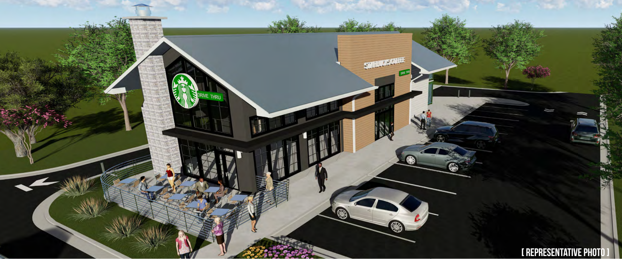
[ REPRESENTATIVE PHOTO ]