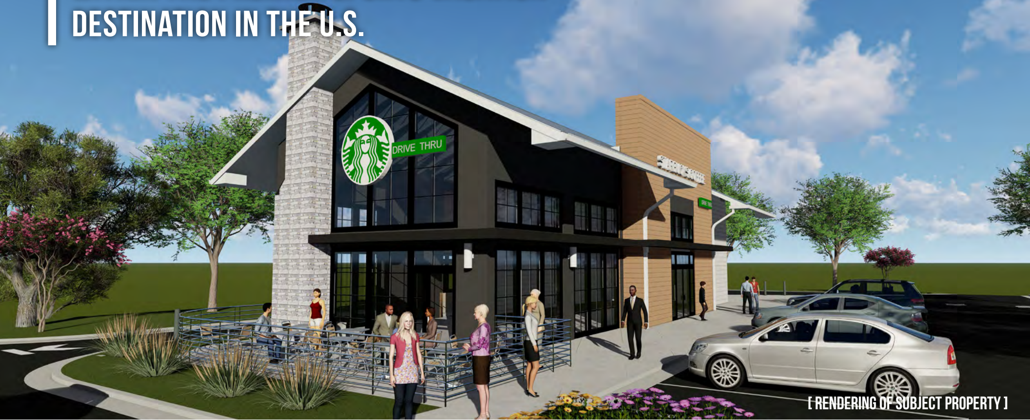
[ RENDERING OF SUBJECT PROPERTY ]

WITHIN THE PREMIER SPORTS VACATION DESTINATION IN THE U.S.