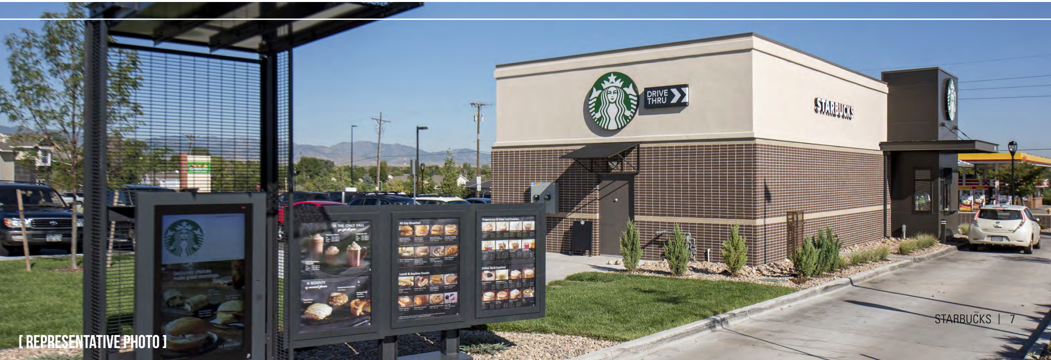
[ REPRESENTATIVE PHOTO ]

This information has been secured from sources we believe to be reliable but we make no representations or warranties, expressed or implied, as to the accuracy of the information. Buyer must verify the information and bears all risk for any inaccuracies.