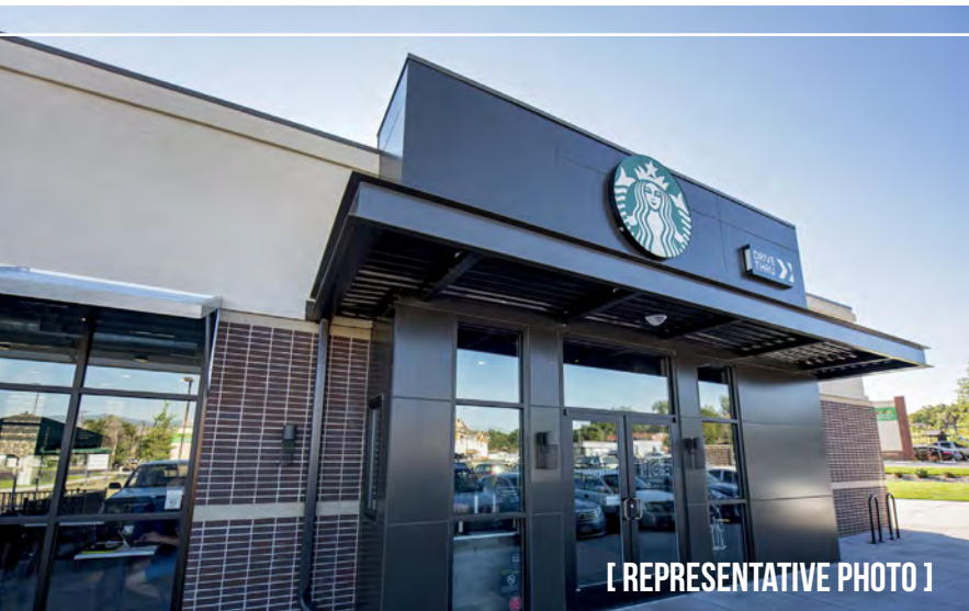
[ REPRESENTATIVE PHOTO ]

This information has been secured from sources we believe to be reliable but we make no representations or warranties, expressed or implied, as to the accuracy of the information. Buyer must verify the information and bears all risk for any inaccuracies.