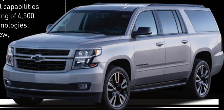
CHEVROLET SUBURBAN RST 📍

Hot on the heels of the Tahoe RST intro-