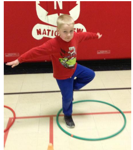
Figure 1 - Stork Stand during Islands

One-Legged Balance – students maintain a stationary position while balancing on one leg with the non-support leg to the side and the arms straight out for balance