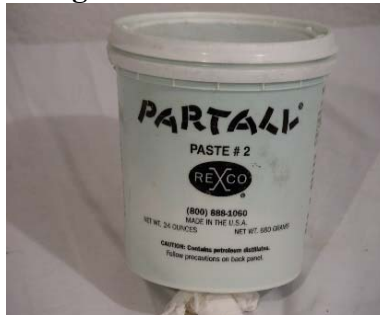
Figure 8: Release Wax

Release Wax: Partall manufactured by Rexco has always given me excellent results.