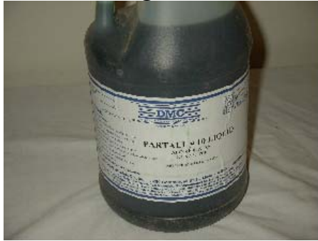
PVA Mold Release