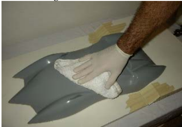
Figure 10: Wax Off

Wax Off: Buff the plug to a smooth, glossy finish.