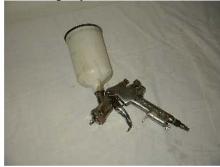
Typical Spray Gun

If the PVA is applied with a spray gun, apply 4 or 5 mist coats at 50 PSI. If the PVA is applied with a cloth, saturate the cloth and wipe the PVA onto the plug with one pass. The PVA will dry in approximately 30 - 60 minutes (depending on the ambient temperature) and is then ready for the first layer of tooling gelcoat.