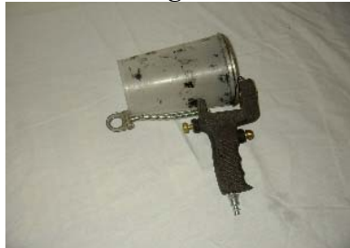
Dump Gun: For Gelcoat