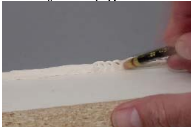
Figure 6: Clay application 2

To ensure proper filling, use an eraser head to push the clay deeper into the gaps.