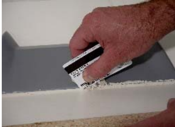
Figure 7: Clay application 3

I like to use an old credit card to remove excess clay. You must use something that won't scratch the plug or the base.