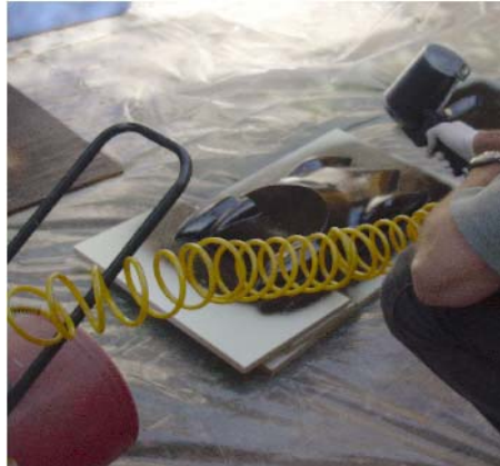
Figure 15: Spraying Gelcoat

Spray the gelcoat at a distance of 6 to 12 inches. Make sure to apply the gelcoat evenly. Make sure to spread a drop cloth. Gelcoat is very adhesive and messy. You don't want gelcoat on something that you don't want gelcoat on.