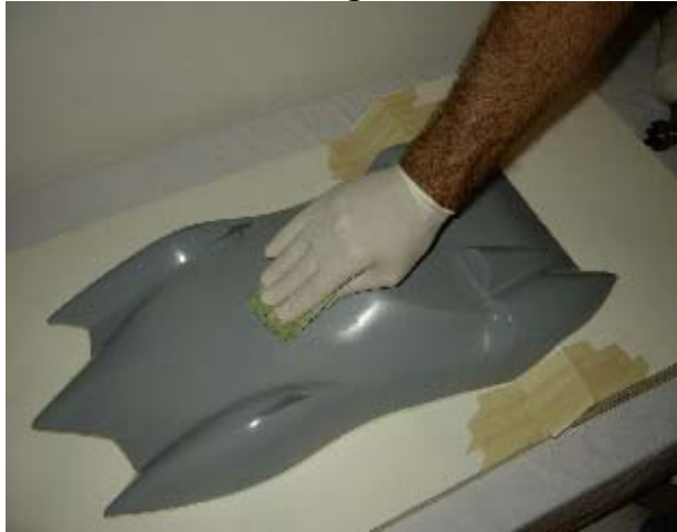
Figure 9: Wax On

Wax On: At least five coats. Notice that I covered some imperfections in the base board with masking tape. It is OK to do this. Just make sure to wax over the tape and apply PVA to it just like the rest of your project.