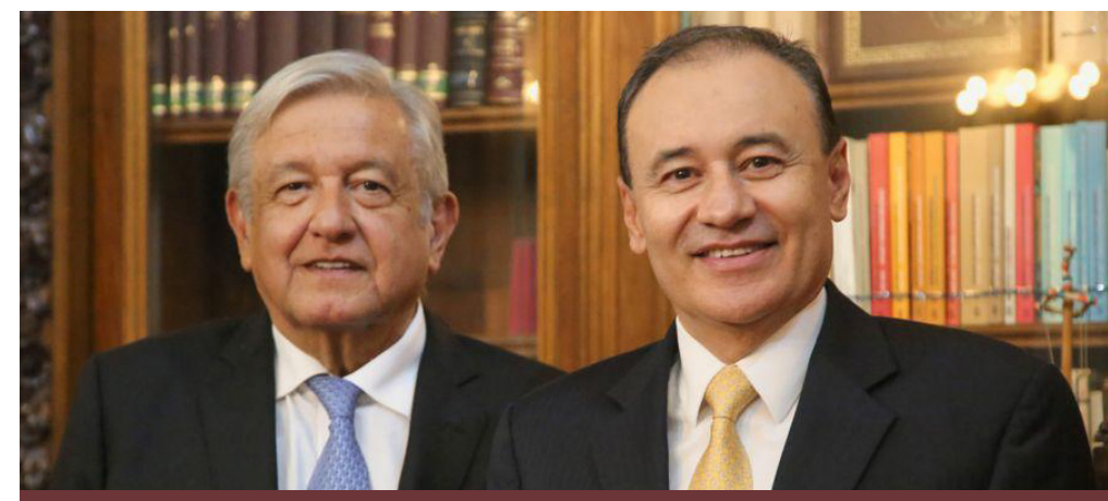
Andres Manuel Lopez Obrador, president of Mexico (I), and Alfonso Durazo, governor-elect of the state of Sonora, Mexico.

We will take advantage of all available cooperation mechanisms such as the United States–Mexico–Canada Agreement (USMCA); the Mexican consular network in Arizona, through the Ministry of Foreign Affairs of Mexico; and the Sonora–Arizona Commission and the Arizona–Mexico Commission, both founded in 1959, to continue building on the legacy