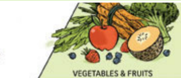
VEGETABLES & FRUITS