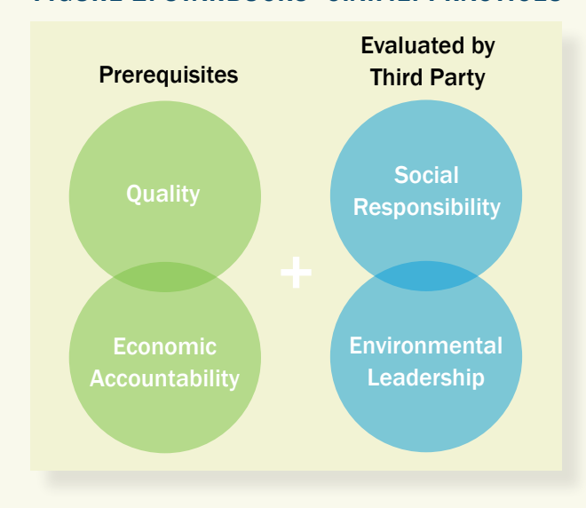
FIGURE 1. STARBUCKS' C.A.F.E. PRACTICES

Building on the success of their work in Chiapas, CI and Starbucks created the C.A.F.E. Practices standard, which has four overarching themes (see Figure 3), with multiple criteria and sub-indicators. The standard has much in common with other, more recent commodity-focused standards in terms of the social and environmental issues it covers, with some coffee-specific criteria based on particular processing and growing techniques. It is notable that the C.A.F.E. standard, like most global standards and certifications, lacks a gender-specific component or lens, and coverage of worker health is limited, with no mention of women's health specifically (Starbucks 2017).