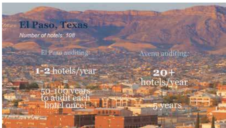
Before and after statistics for El Paso's hotel audit program