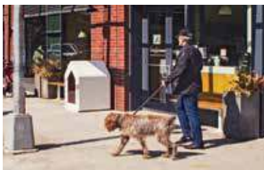
Dog friendly cities.

For dog owners, Dog Parker offered the convenience of a leash hook without danger to the animal and the ability to take dogs with them without neglecting dogs' needs. Cities accommodated their dog owning residents by providing a safe and innovative way for them to enjoy their community with their dog. For local business owners, Dog Parker offered a liability-free way to accommodate customers who are joined by their dogs, a powerful differentiation from competitors, and a draw for customers to patronize brick and mortar retail instead using online shopping services.