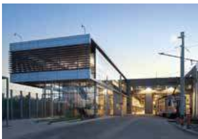
LA Metro Facility Exterior