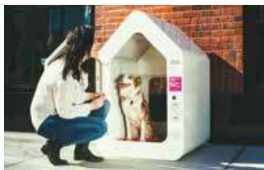
A safe spot for your dog to wait.