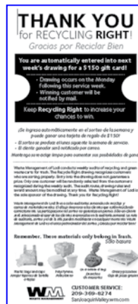
Lodi Thank You for Recycling Right tag