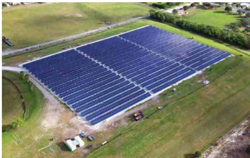
Solar farm atop Lake Worth landfill