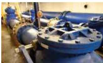
The partnership in Bayonne has helped build economic prosperity