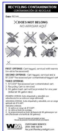
Lodi Recycling Contamination tag