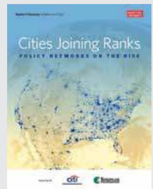
New Report: Cities Joining Ranks—Policy Networks on the Rise

General Tips: The full report, Youth Lead the Change: Participatory Budgeting Boston 2016 , is available at http://www.bu.edu/ioc/research/faculty-publications/ . A corresponding academic research paper, "She treated us like we bring valid ideas to the table:" Youth experiences of a youth-led participatory budgeting process, was published in CHILDREN AND YOUTH SERVICES REVIEW in May, 2017.