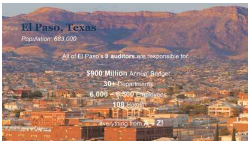
El Paso's challenge: 9 auditors to cover all tax types