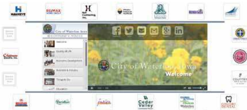
Waterloo’s video interface with local business participants featured.