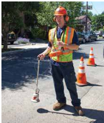
Leak detection equipment has helped over 2,000 residents save water and money