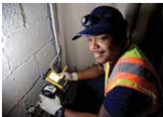
Meter upgrades in Bayonne reduce non-revenue water for the city

Impact: Improvements throughout the network have included updating Bayonne's infrastructure to include an Automatic Metering Investment (AMI) system. AMI is an aggressive leak-detection tool used to drive down unaccounted for water. All meters, including every commercial meter, have been changed out throughout the city. In addition to AMI, SUEZ installed a Supervisory Control and Data Acquisition (SCADA) system, which detects any issues with water and wastewater throughout the city. The inclusion of a Geographic Information System (GIS) allows SUEZ to properly manage our assets by geo-plotting all of our assets so that we can pull them up on electronically on a Computerized Maintenance Management System (CMMS). This new addition allows SUEZ to locate an asset and track its maintenance right within the work order system instead of having to locate it on a traditional printed map.