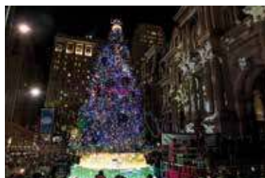
Philadelphia's City Hall Tree Lighting