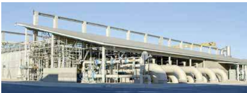
The city's fully-virtualized, IoT-based, state-of-the-art water treatment plant.

VMware infrastructure allows the 3D mapping of crime scenes and fingerprint identification by police officers in the field, and "smart" utility metering of its vital water and sewage services that significantly enhances water conservation while reducing costs for customers. The virtualized infrastructure also supports the city's water treatment plant and its state-of-the-art Internet of Things (IoT) automated monitoring system.