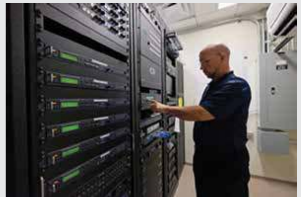
VMware server virtualization enables North Las Vegas to improve city services and save millions of dollars.

All of the city's software applications, including cloud-based services and applications, now run over the VMware virtualized infrastructure. These apps make it possible to deliver more efficient services, reduce city costs, and react more responsively to the needs of its city agencies and citizens. Among the immediate benefits is how new applications allow the city to accelerate the approval process for new construction and business permits from weeks or months to just days or hours.