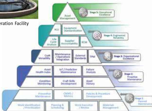
EDI – Enterprise Asset Management Value Pyramid