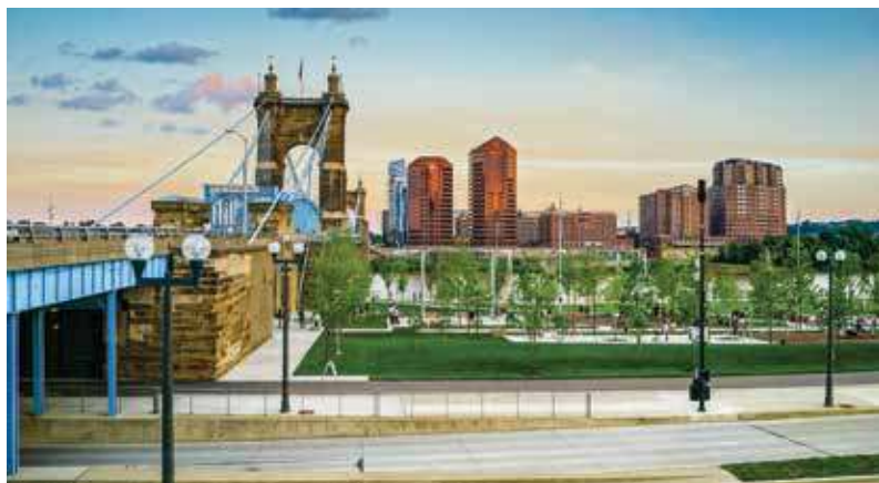
City of Cincinnati

Learn more about at www.americanfitnessindex.org .