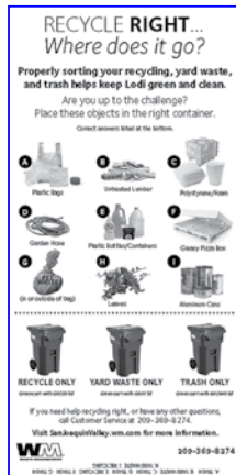
Lodi residential ad