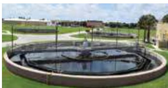
Palm Beach County Aeration Facility

Impact: EDI and Palm Beach County Water Utility reviewed the current and future processes of the Utility and identified opportunities for predicative asset management. The Team provided several critical improvements for lifecycle tracking as well as resource and asset performance indicators. EDI mapped these essential processes to the Maximo Enterprise Asset Management Program and shared information throughout the organization to ensure early user adoption. Bringing together the team of experts, EDI facilitated workshops to identify and quantify Organizational Change Management initiatives.