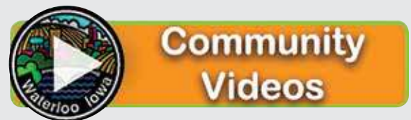
Waterloo’s custom Video Tour button featured on their city’s official homepage.

Funding: Private Financing, Business sponsorships