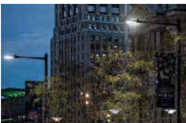
City Streetlights with Flashnet Controller on Top