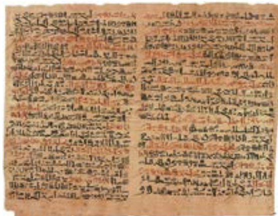
Figure 3. Edwin Smith's Papyrus: Plates VI and VII (displayed at the Rare Book Room in New York Academy of Medicine)

Surgical supply was very useful and practical. A famous relief on the wall of the temple at Kom Ombo Temple shows about 40 different medical instruments (Figure 3). These include speculums to open the vagina and rectum for internal examinations, containers for holding solid and liquid medicines, forceps, dental tools, suction cups, hooks for special spreading open incisions and wounds, and curettes for scraping away infected tissue. Surgical tool also included knives, drills, saws, hooks, scalpels, retractors forceps and pinchers, scales, spoons and a vase with burning incense (25, 27, 40, 41).