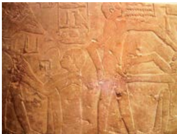
Figure 1. Adolescents in ritual circumcision, Tomb of Ankhmahor, Saqqara – Egypt

According to the wall inscription from the Old Kingdom (2635-2155 B.C.E.) anatomy was very well understood and dissection of human body was a common procedure. The amputation or deep surgery were avoided for the rules that the body must not be disintegrated, for the whole body is necessary for the afterlife. Circumcision was an exception to this rule, the Egyptians, like other ancient peoples recognized the importance of circumcision. The world's first known picture of a surgical operation, carved on the wall of a tomb of Ankh-Mahor at Saqqara around 2250 B.C.E. shows doctors performing a circumcision (Figure1)(21). According to Herodotus, Egyptians were the first to circumcise children and it was practiced for reasons of hygiene (22). The ancient Jews may have learned the surgical technique of circumcision from Egyptian civilization; and circumcision is the only surgical procedure mentioned in the Old Testament (23).