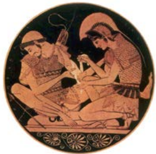
Figure 4. A cup by Sosias: Achilles bandaging the injured arm of Patroclus (vase displayed in Antikemuseum, Staatliche Museen Preußischer Kulturbesitz, Berlin

The earliest description of ancient Greek medical practice derives from the two epic poems attributed to Homer (47), the Iliad and the Odyssey, dated around the 8 th century B.C.E., presenting last parts of Aegean war against Troy. Surprisingly enough, among the poem lines there are descriptions of nearly 150 different battle wounds: injuries made by arrows and spears are with excellent anatomic description (Iliad XIII. 640-653) (48), 31 lethal head injuries (48,49, 50, 51). The procedures of healing and care giving are also recorded. Medical care among Greek warriors was organized by professionals. One of the art healing masters was Machaon, the son of the legendary Asclepius. He was very skilled in taking up the arrows and healing the wounds (48). The soldiers were educated to help themselves and also to help each other (Figure 4). They cleaned the wounds with wine (Iliad XI. 638) (48), and bandaged them with certain herbs. In military surgery, many scientific rules were applied and it comprised systematic observation. Surgical procedures were always accompanied by prayers and magic (52).